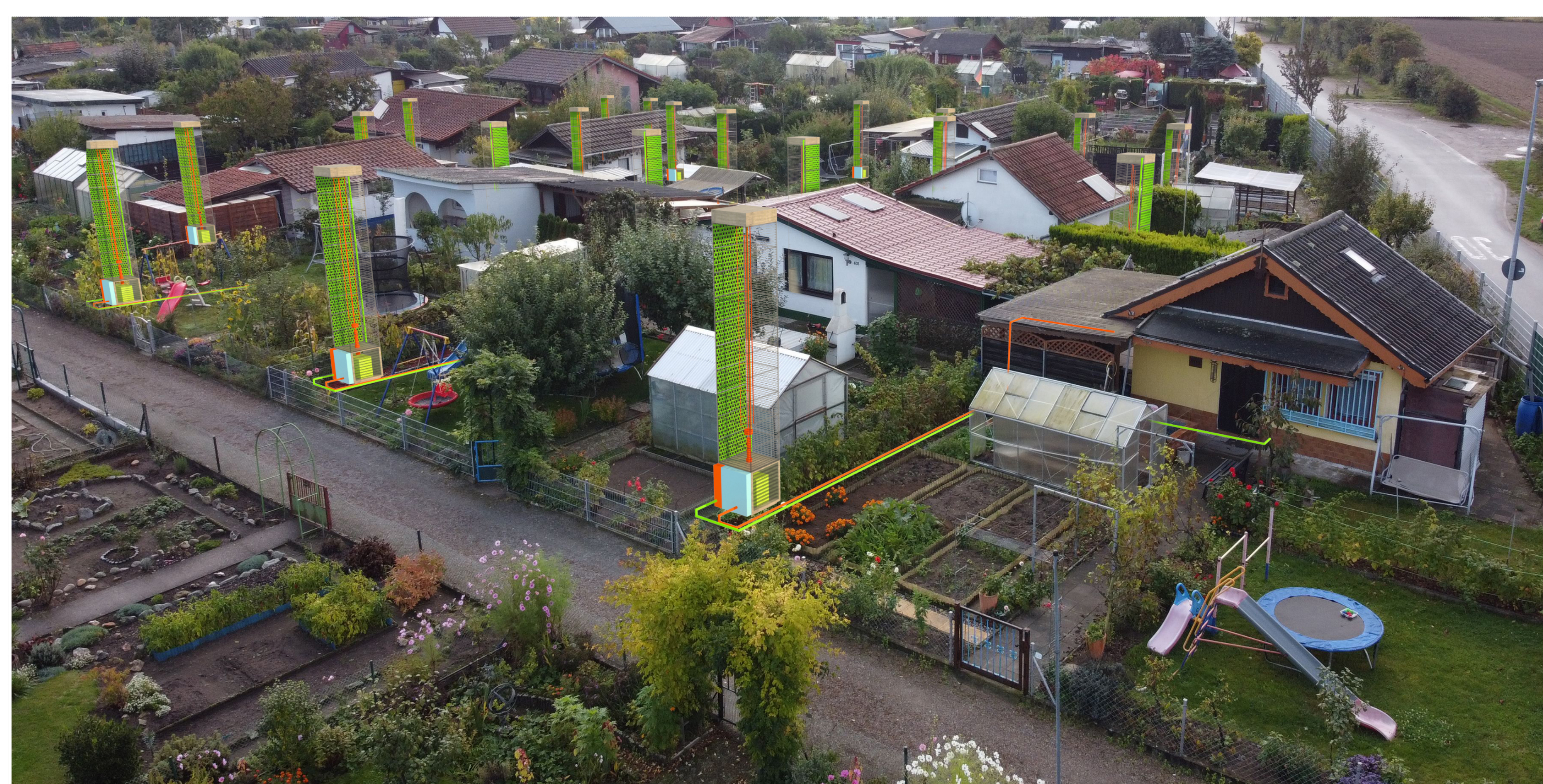
PERSONAL GREEN BOX