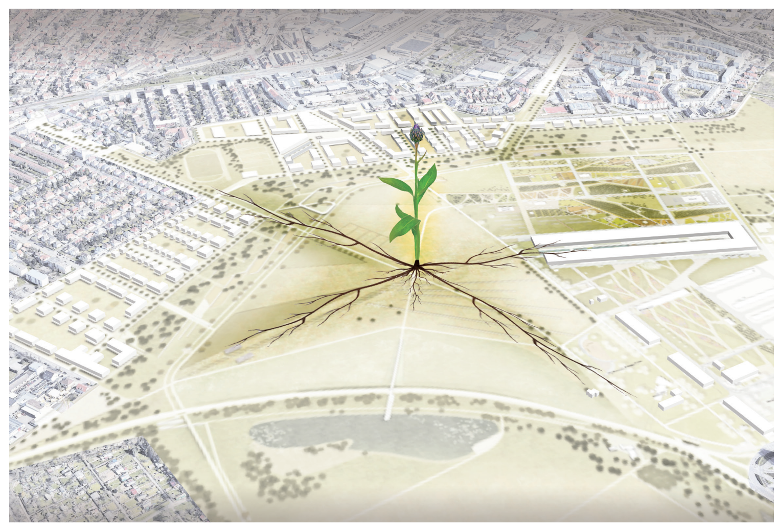
Metaphorically planted at the intersection of the park corridors from all direction, the emblem will serve as a focal point with its roots extending to the neighborhood.

A contextual symbolism of hope for a brighter future and love for culture and environment.