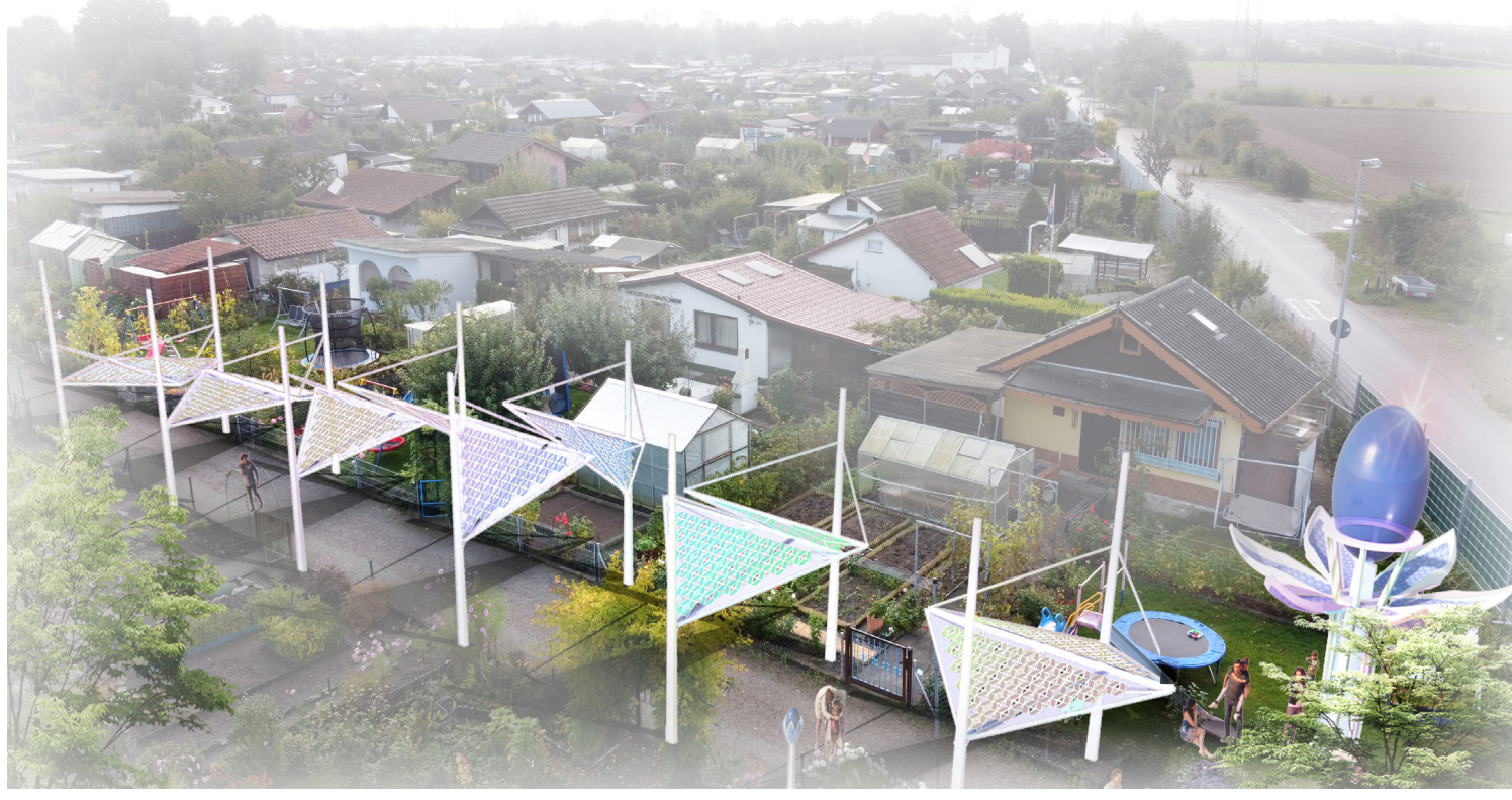
Potential application of thematic sustainable art installation at local garden scale to provide green energy, shade and cultural identity.