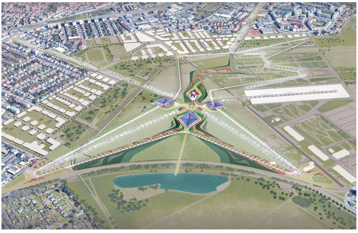
A re-configurable art installation that will collectively create a gateway element, frame a corridor or create a rhythmic spatial experience forming the unified grand sculpture. These will anchor, activate and interconnect thematic open spaces that supports the program of the adjacent developments .