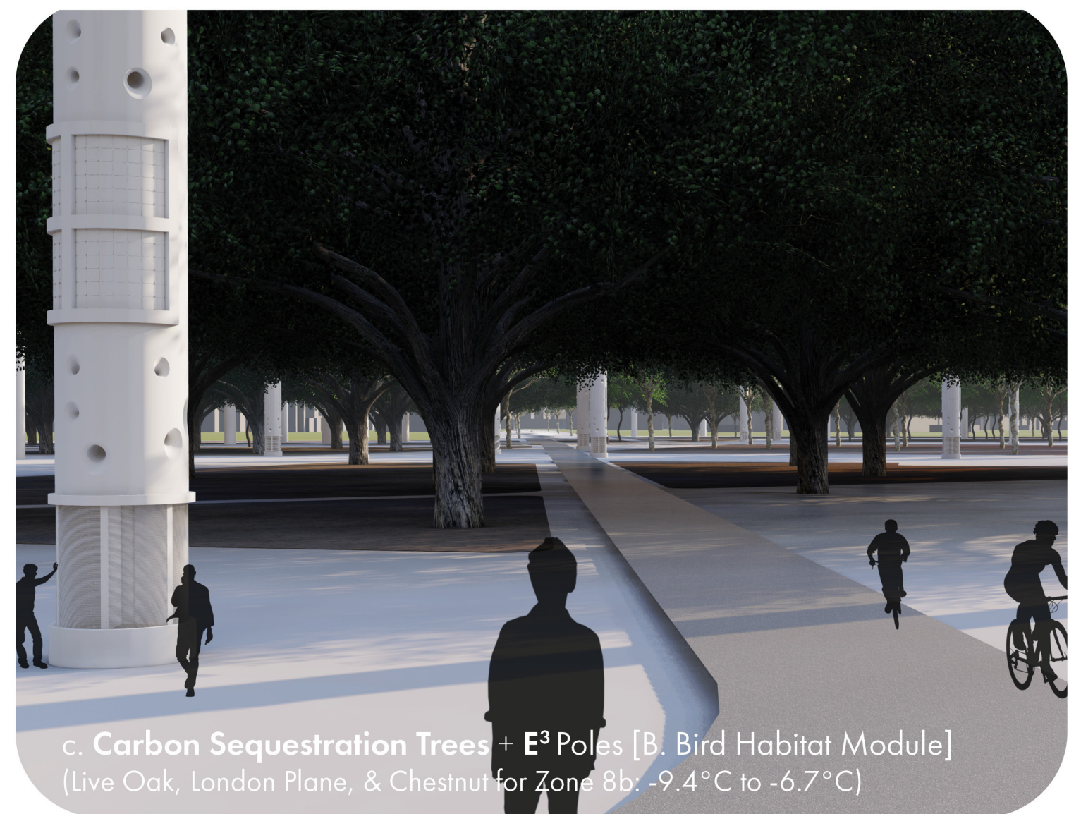
c. Carbon Sequestration Trees + E 3 Poles [B. Bird Habitat Module] (Live Oak, London Plane, & Chestnut for Zone 8b: -9.4°C to -6.7°C)