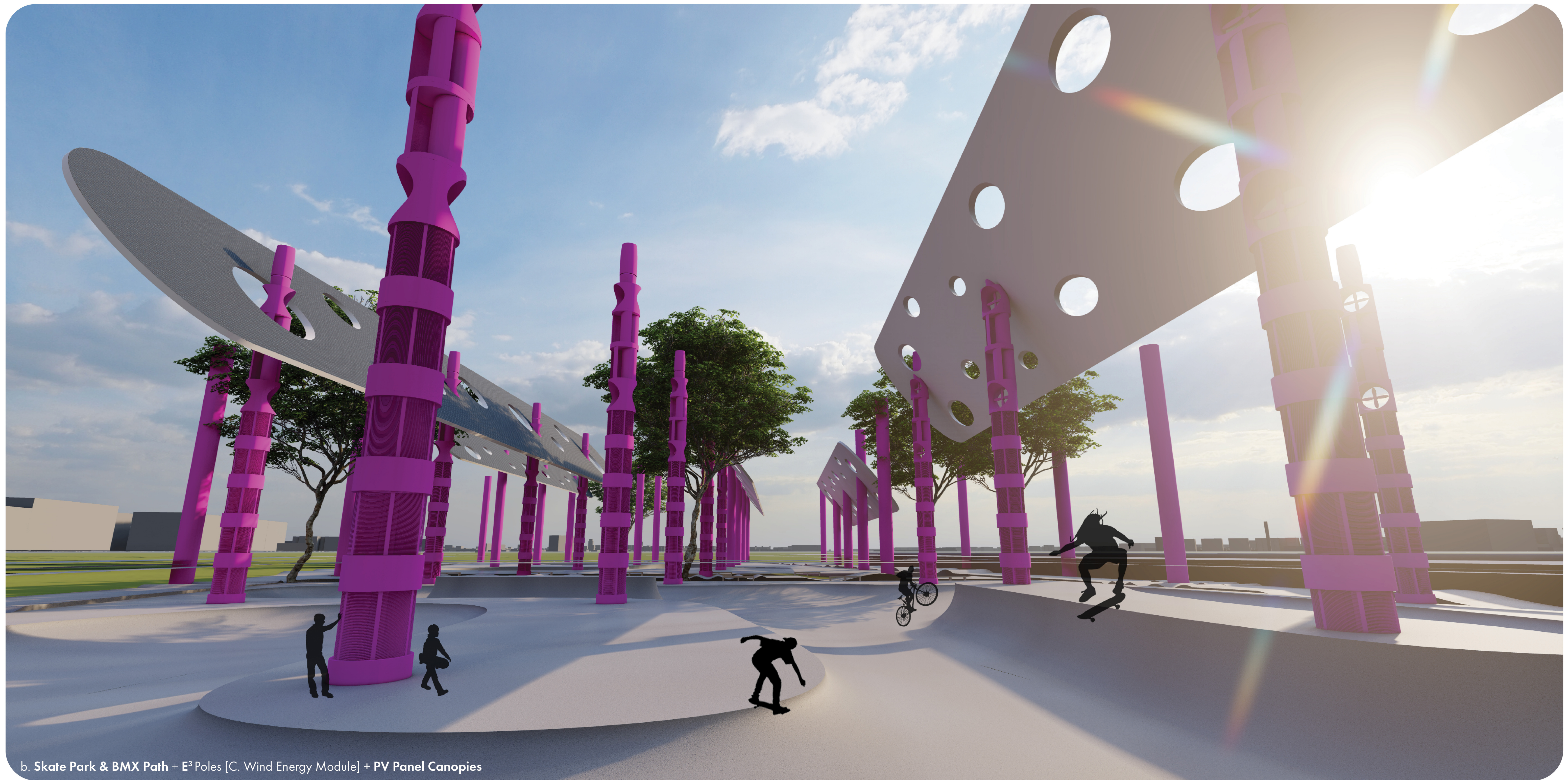
b. Skate Park & BMX Path + E 3 Poles [C. Wind Energy Module] + PV Panel Canopies