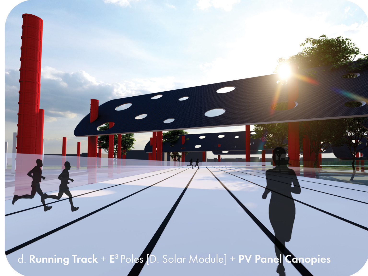
d. Running Track + E 3 Poles [D. Solar Module] + PV Panel Canopies