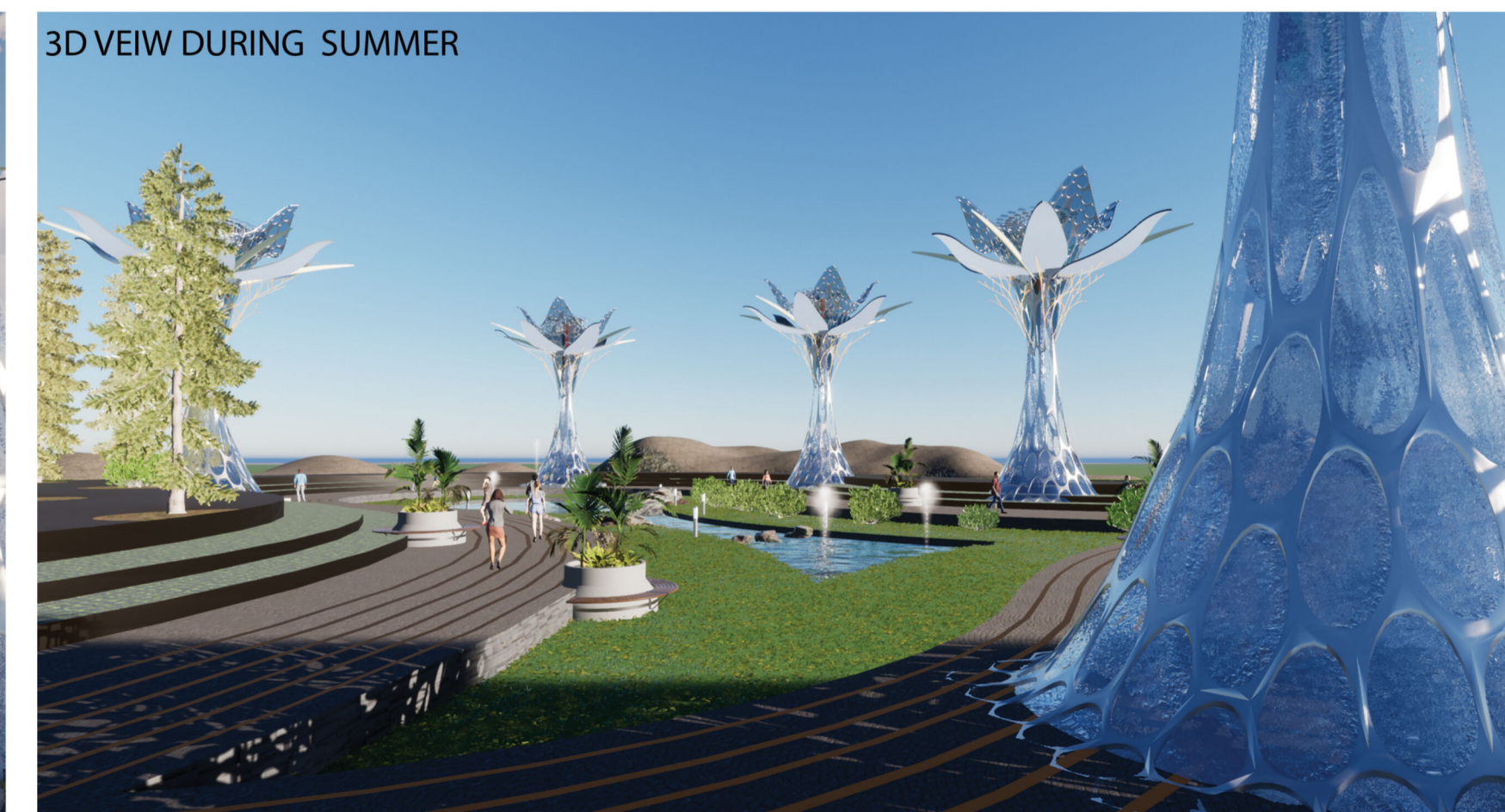
3D VEIW DURING SUMMER

THE FORM OF THIS STRUCTURE BEING DERIVED FROM A PLANT NATIVE TO THE SITE IS A WAY FOR IT TO BLEND INTO THE SURROUNDINGS AND REPRESENT THE DIVERSITY OF THE LAND.