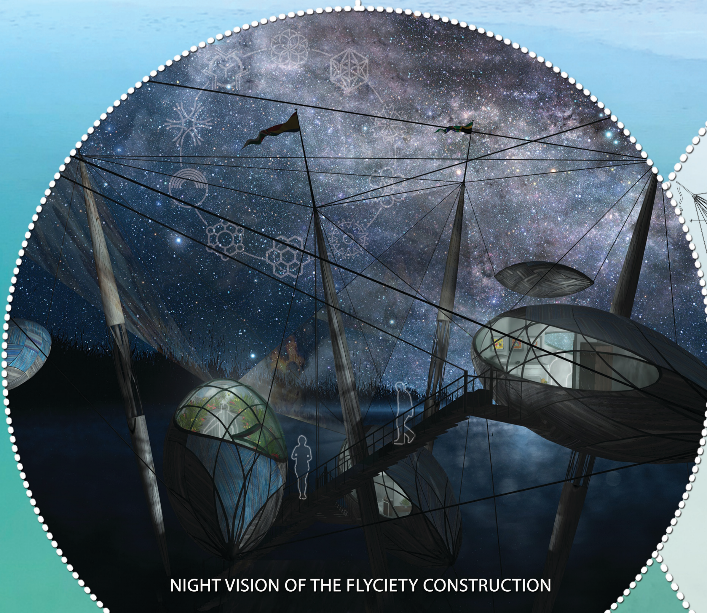
NIGHT VISION OF THE FLYCIETY CONSTRUCTION