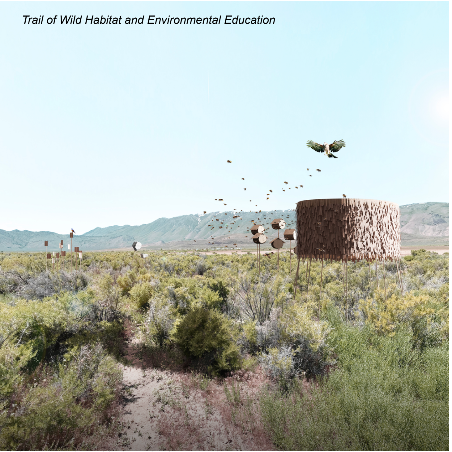
Trail of Wild Habitat and Environmental Education

We chose the site marked in red at Fly Ranch for intervention. Visitors can interact with smaller lodgers on the trail. At the Center, they can participate in environmental learning led by the Fly Ranch community and appreciate the natural beauty of Fly Ranch from the viewing tower.