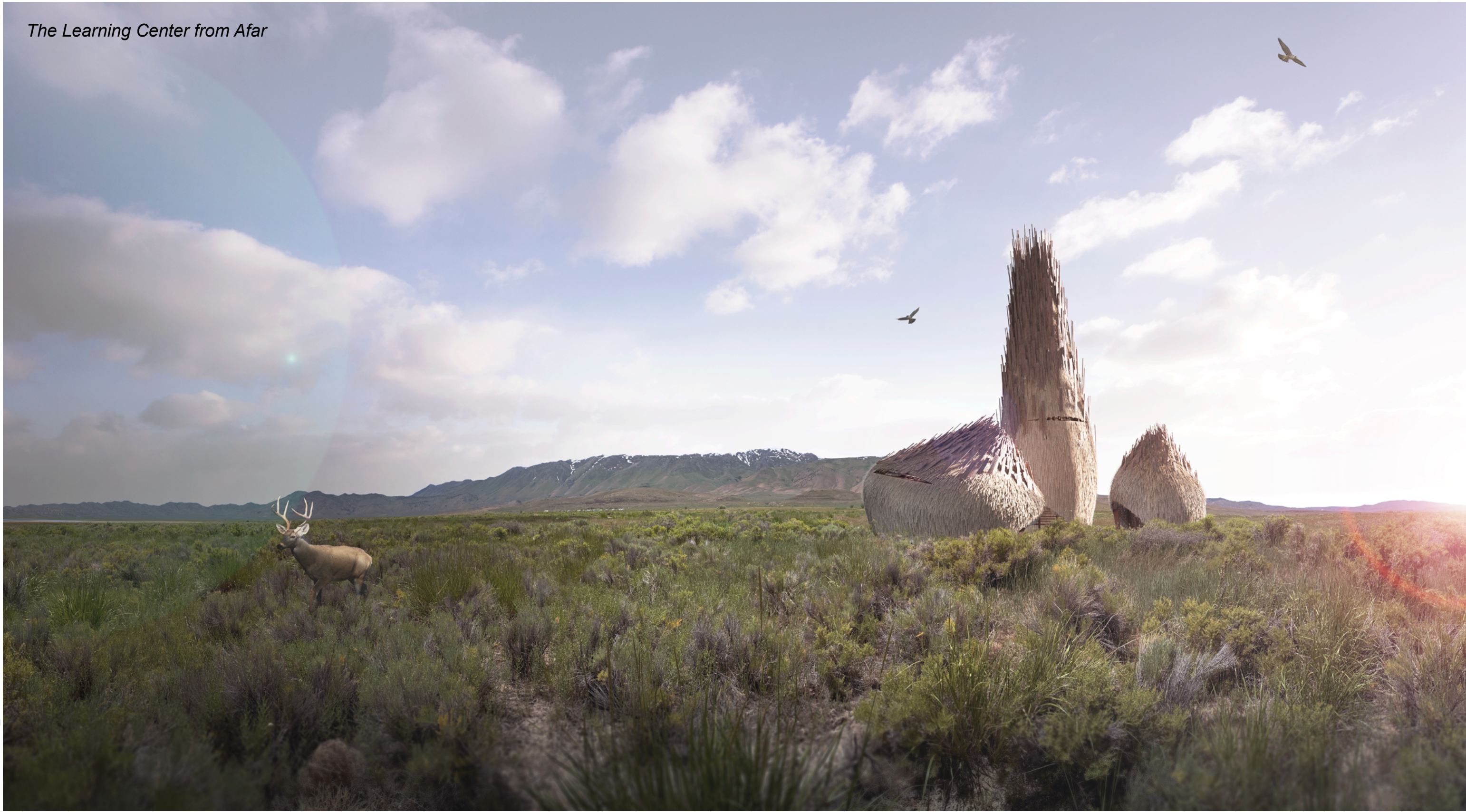
The Learning Center from Afar