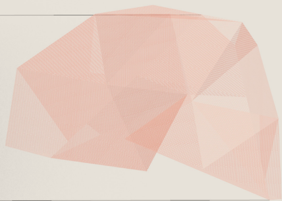
TENSILE NYLON MESH 5,840 SF