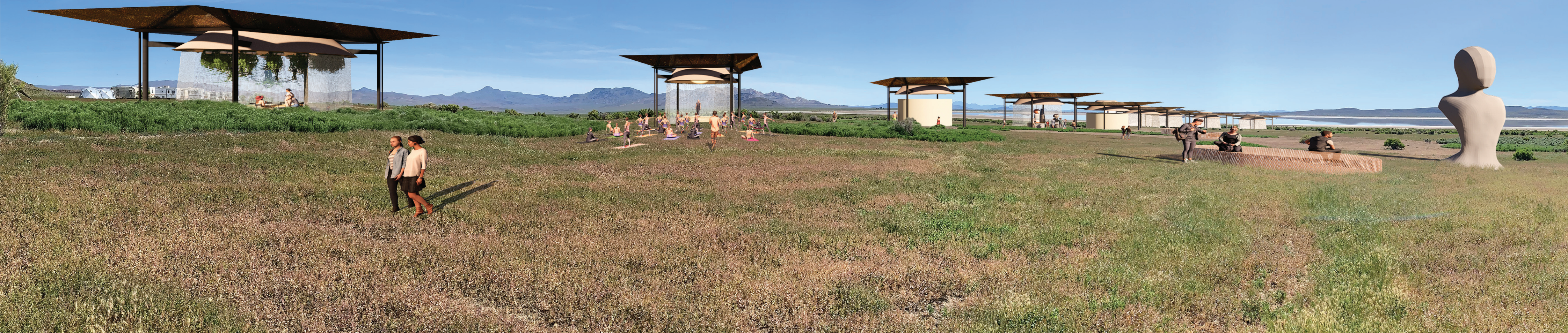
Collectors array across a field to provide a framework of power, water, and shelter. The open-source pavilions can be outfitted to support recreational activities and essential functions.

94.9 megawatts (zone 1 only) and 260,000 liters of rainwater annually