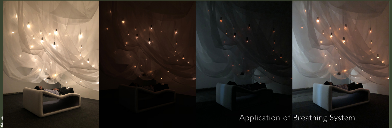
Application of Breathing System