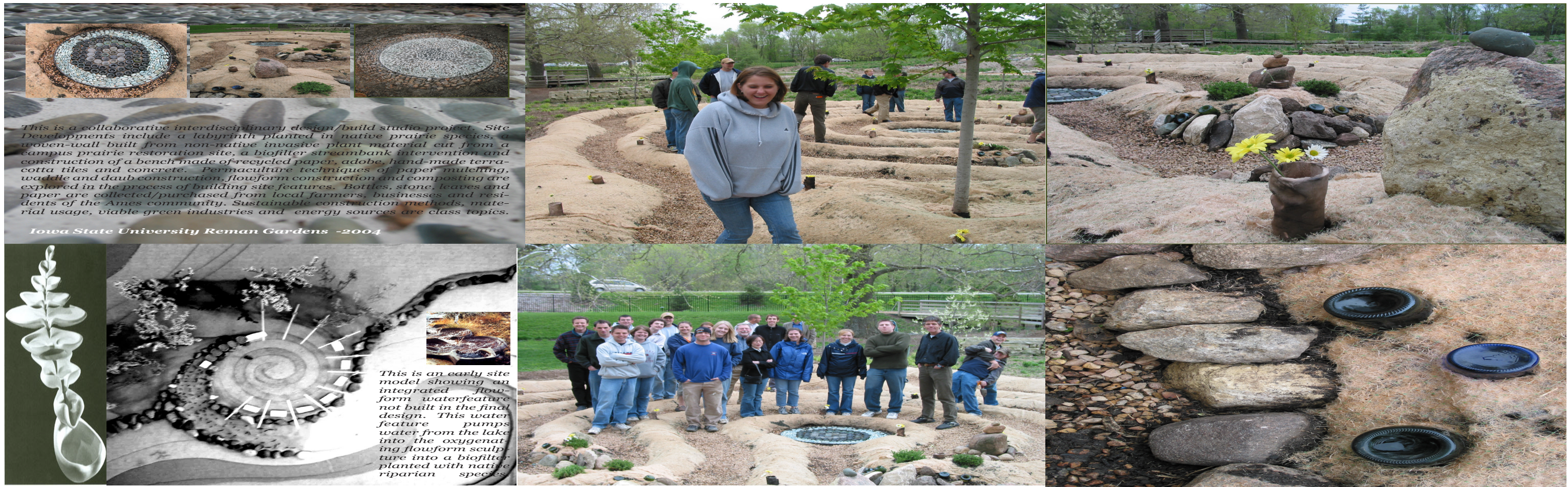
Rituals, Rites and Reclamation: Points of Light: Hydroponic, Solar Raincatchment System for Detroit Urban Farm