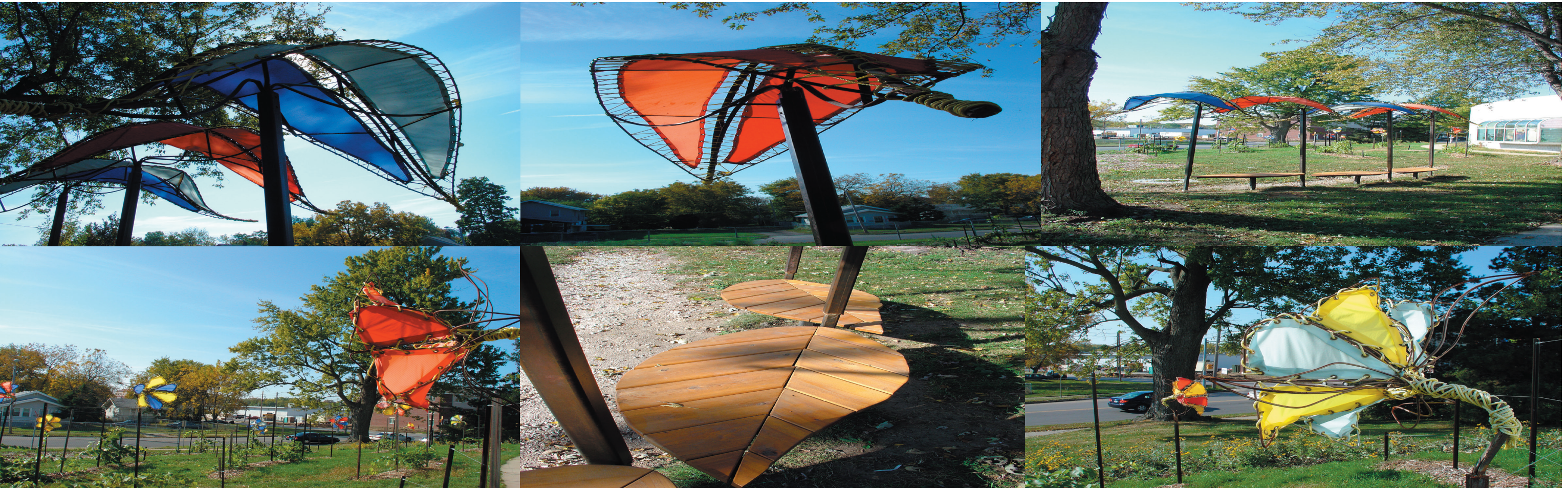
Community-built Infastructure for School Garden : Hand-crafting community spaces for local foodsystem and education