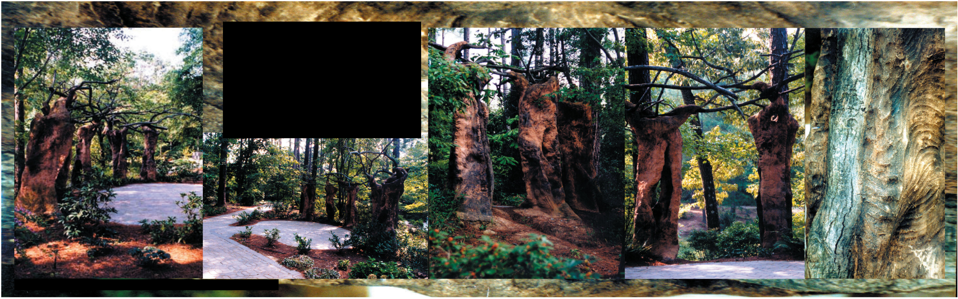
TreeSpirits: Hydroponic, Site-Harvested Adobe/Rammed Earth Arbor for Wildlife Habitat Garden in Botanical Garden Setting