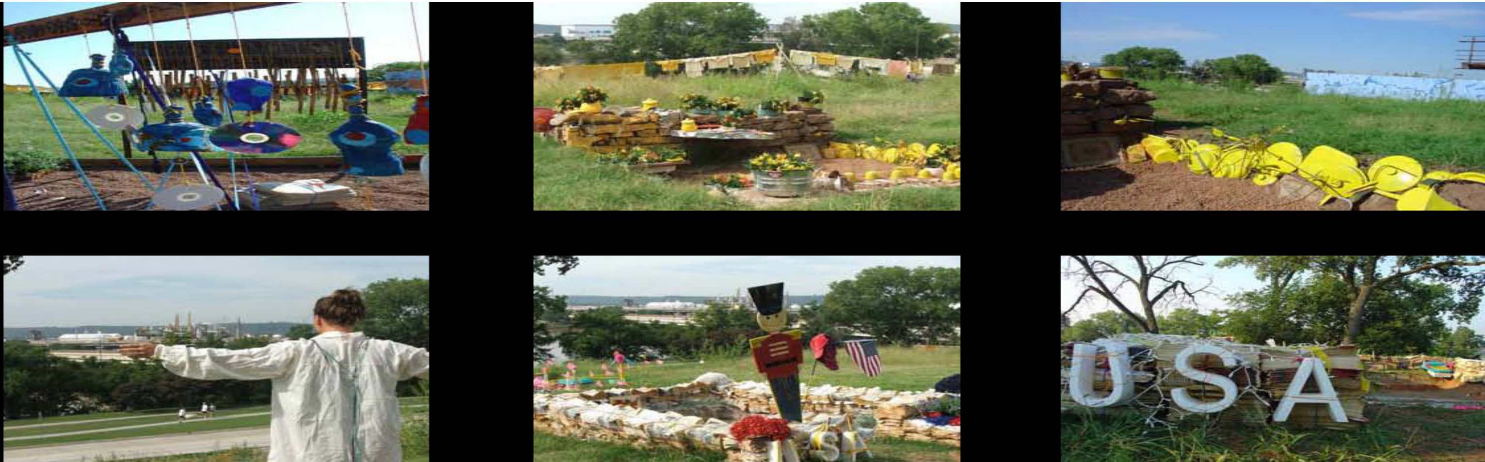
Rituals, Rites and Reclamation: Reawakening the 66 Cultural Stories of Place create six landscape installations created with up-cycled objectson two acres of land on Route 66 - Andy Warhol Prize Winner