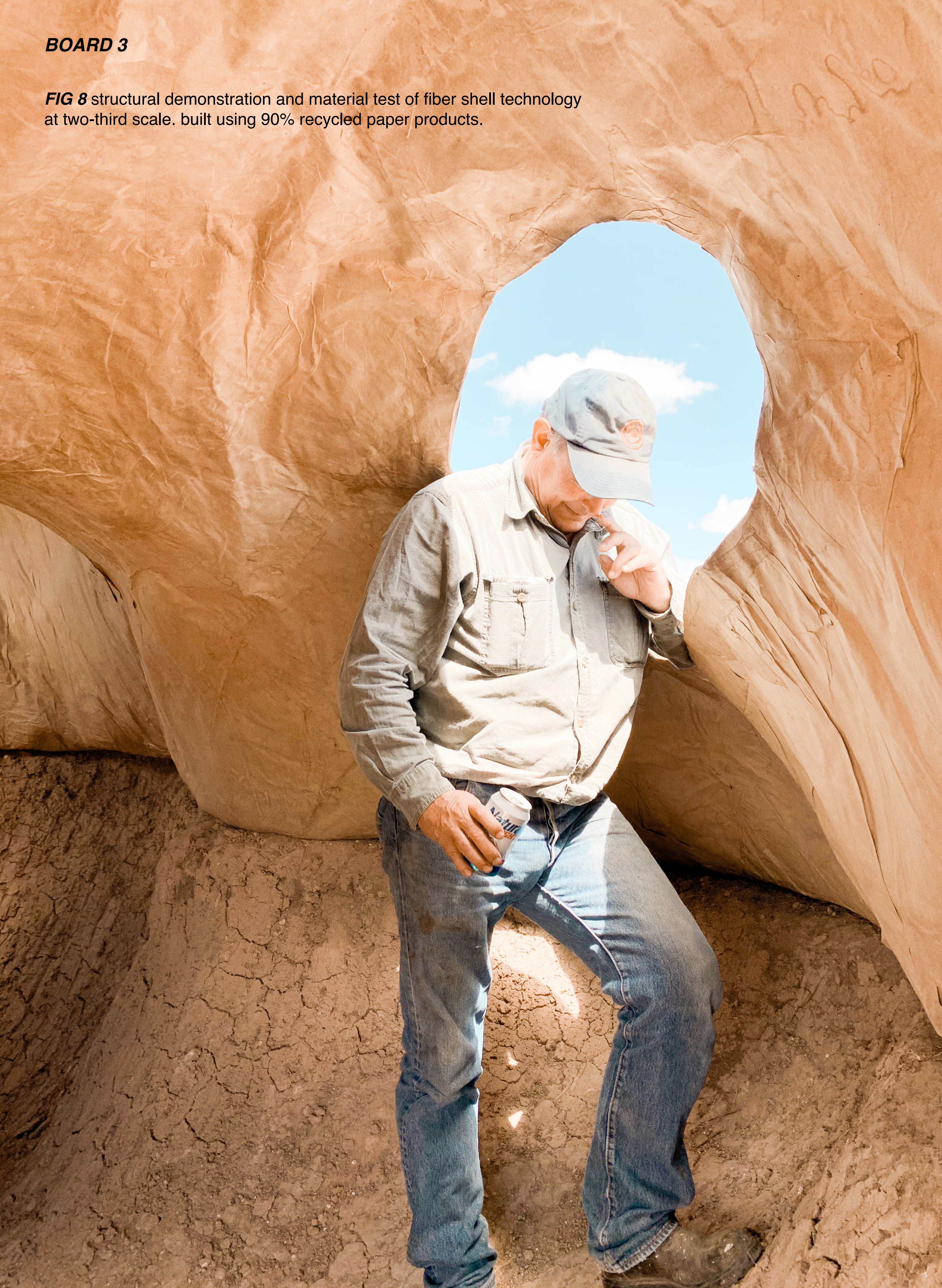
FIG 8 structural demonstration and material test of fiber shell technology at two-third scale. built using 90% recycled paper products.