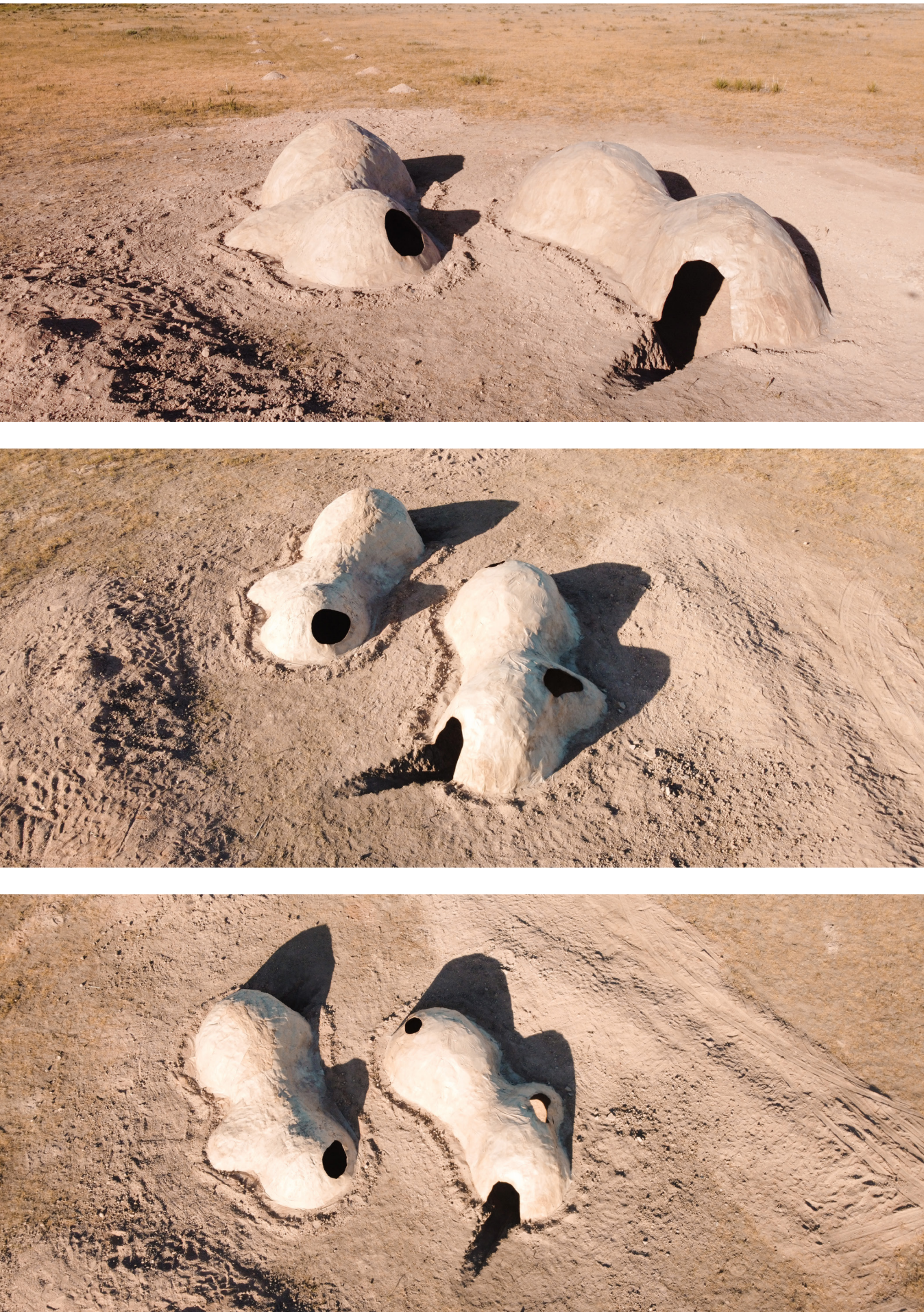
FIG 11 exterior photographs of material test