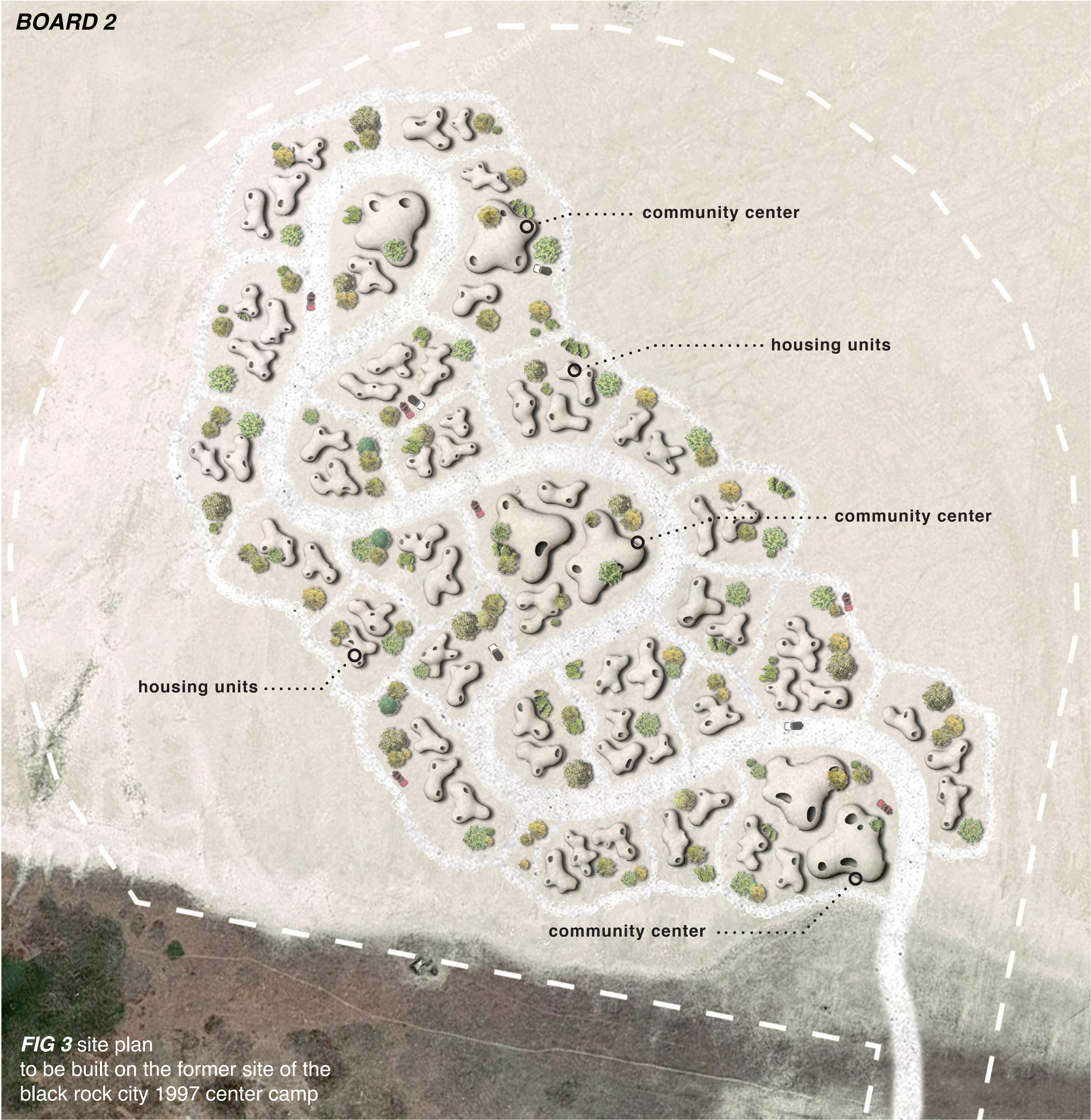
FIG 3 site plan to be built on the former site of the black rock city 1997 center camp