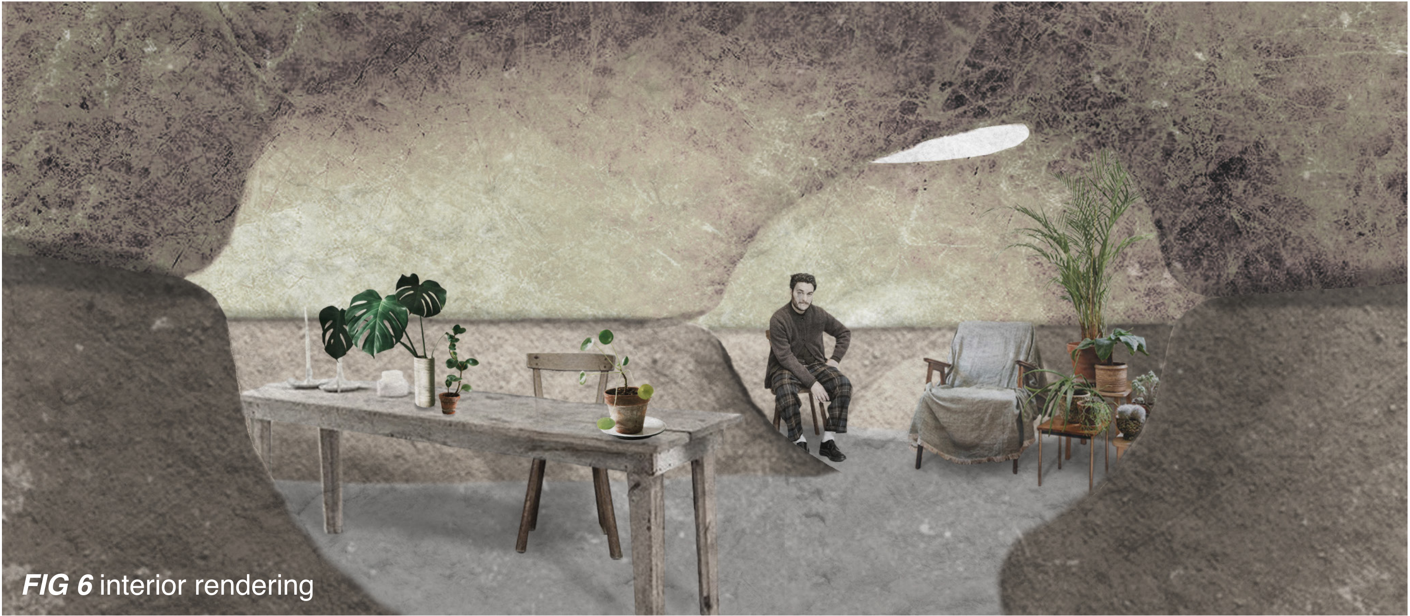
FIG 6 interior rendering