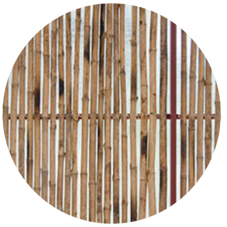
DRIED REEDS + WILLOWS