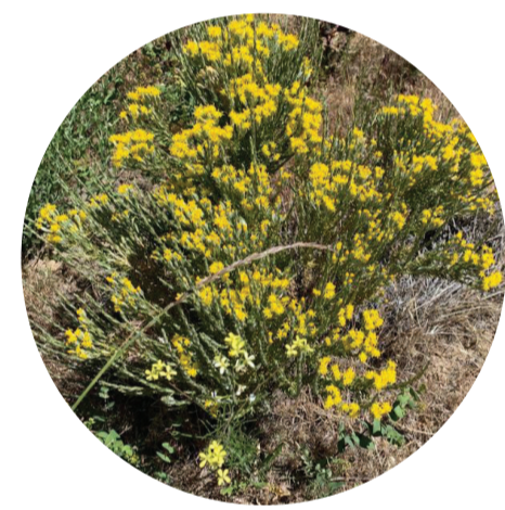
BLACK ROCK FLORA GREEN ROOF