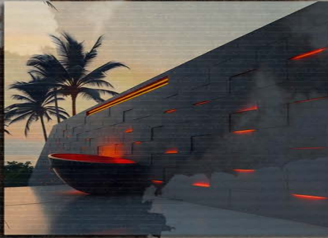
Nightcafe_ Upscaled AI generated prototype, retrieved 19th of April 2025