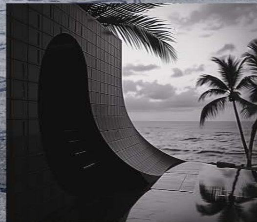
Archivarius Updated AI generated prototype Nishicafe - retrieved 19th of April 2025

Set on a gently sloped site on Naviti Island, the installation will rise from the landscape with the grace of Vatu Rua mountain. The generative feature will invite wind and water to pass through the wall facade, becoming a living symbol of renewal. Located close to the Vatu Rua site and between the mountain and ocean, the structure will serve ceremonial and everyday purposes, offering a place of reflection and learning. The resulting work does not impose but listens, evoking the unseen systems of wind, light, tide, and story that sustain the island's life.