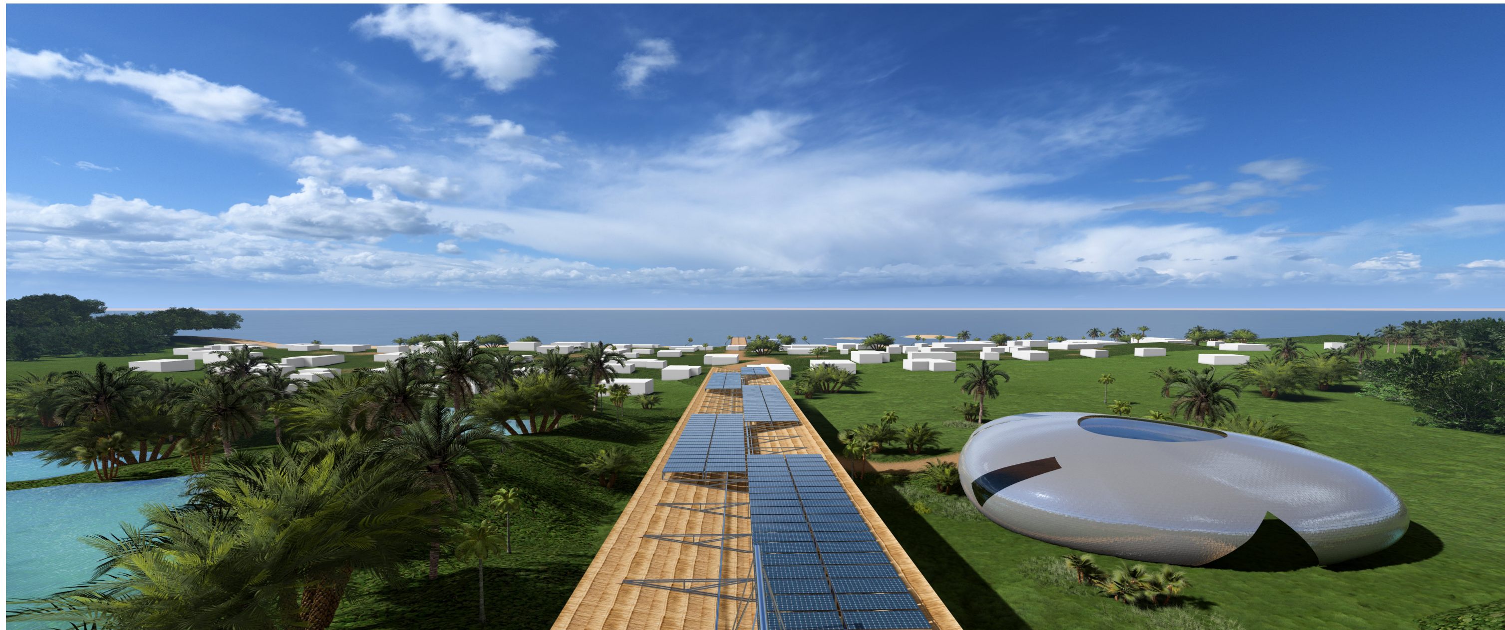
Fiji LAGI 2025 Land Art for a Changing Climate