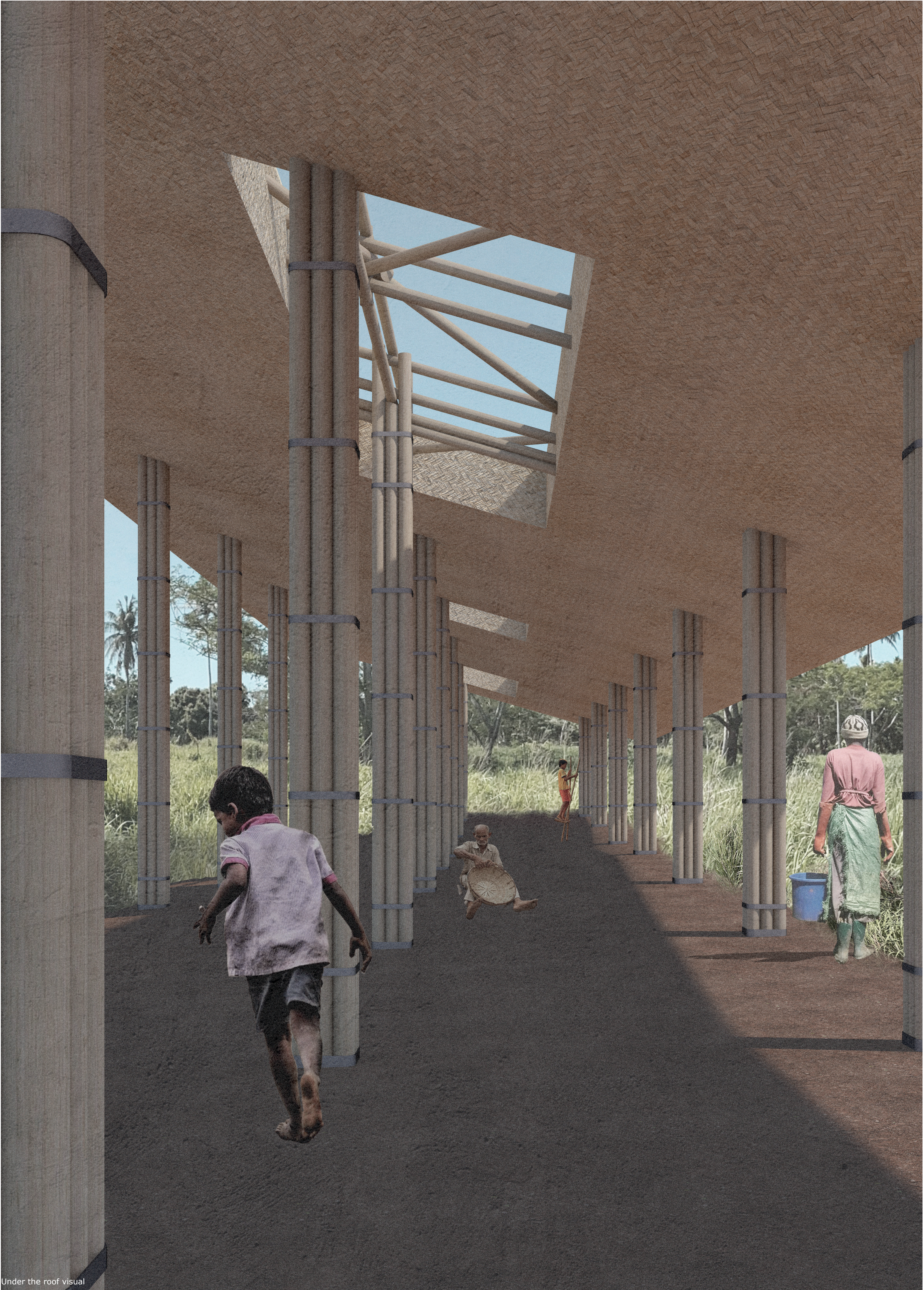
Under the roof visual