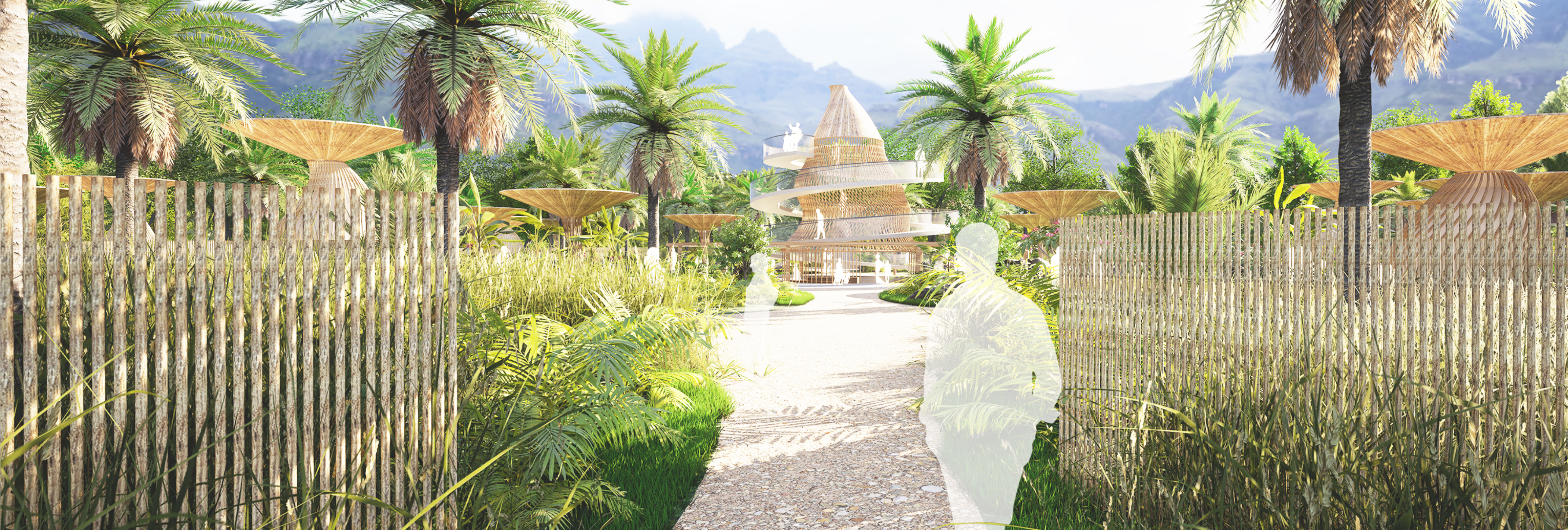
Where village meets the Meke Nexus: Southern entrance