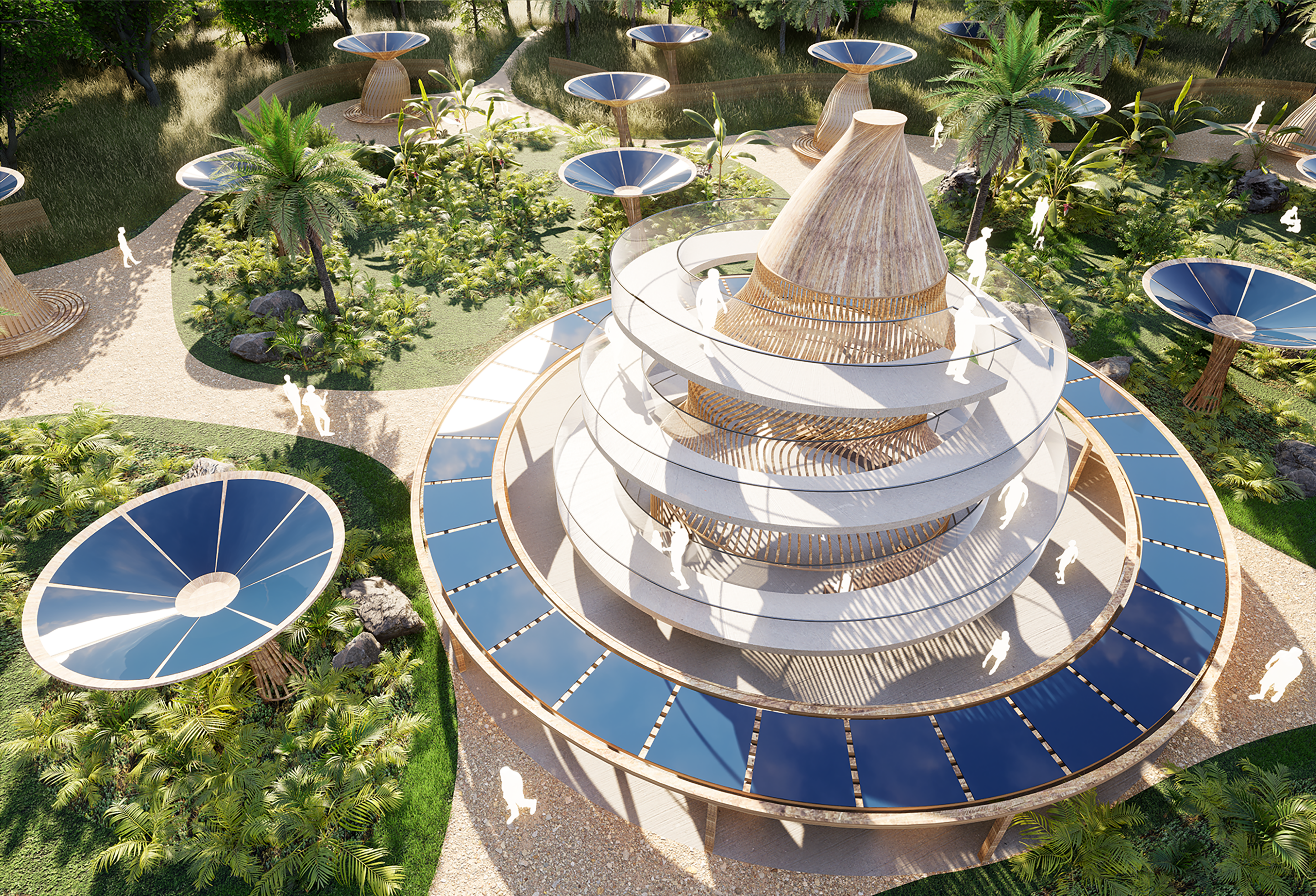
A Glimpse of the Nexus: Aerial perspective of the site