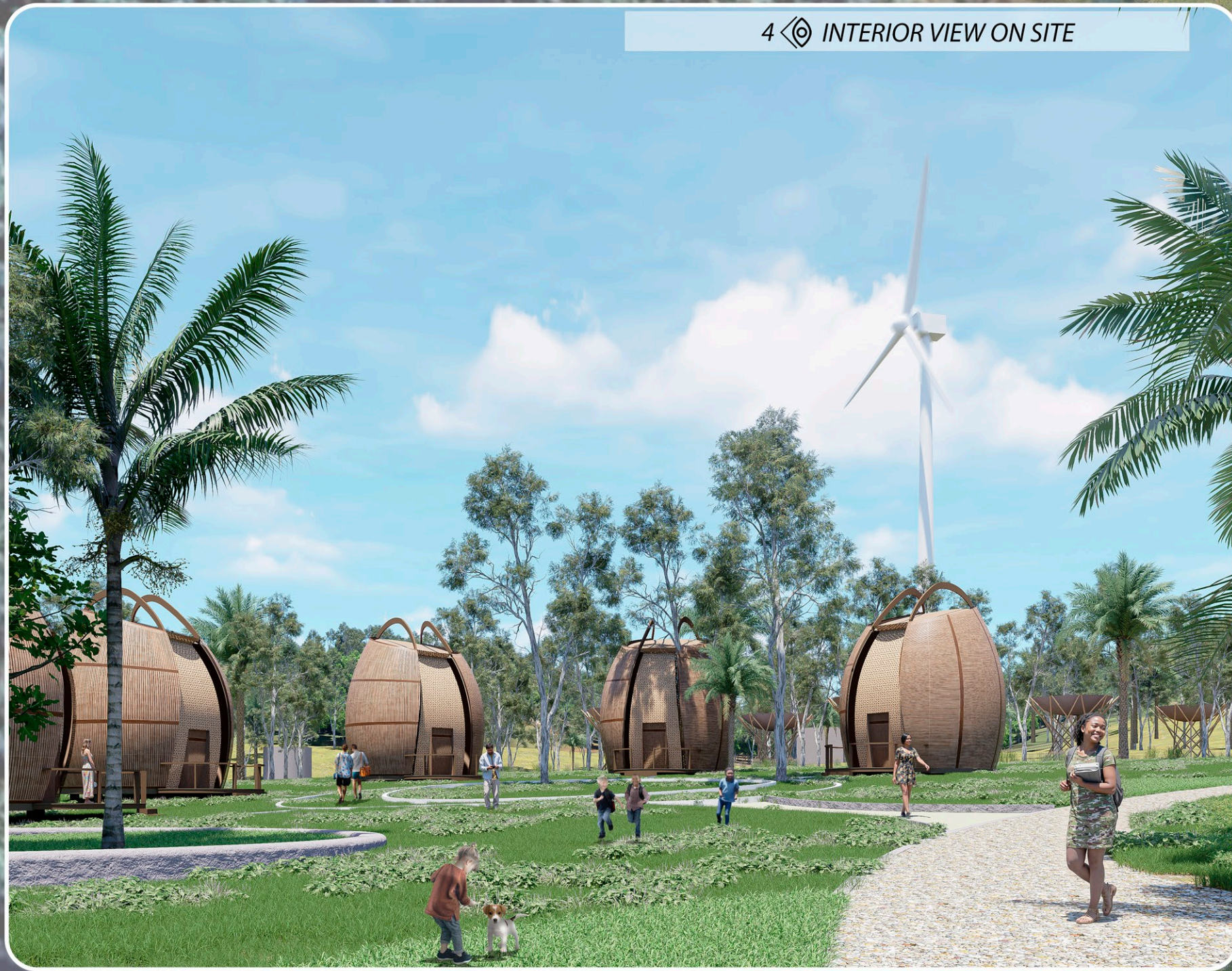
4 INTERIOR VIEW ON SITE