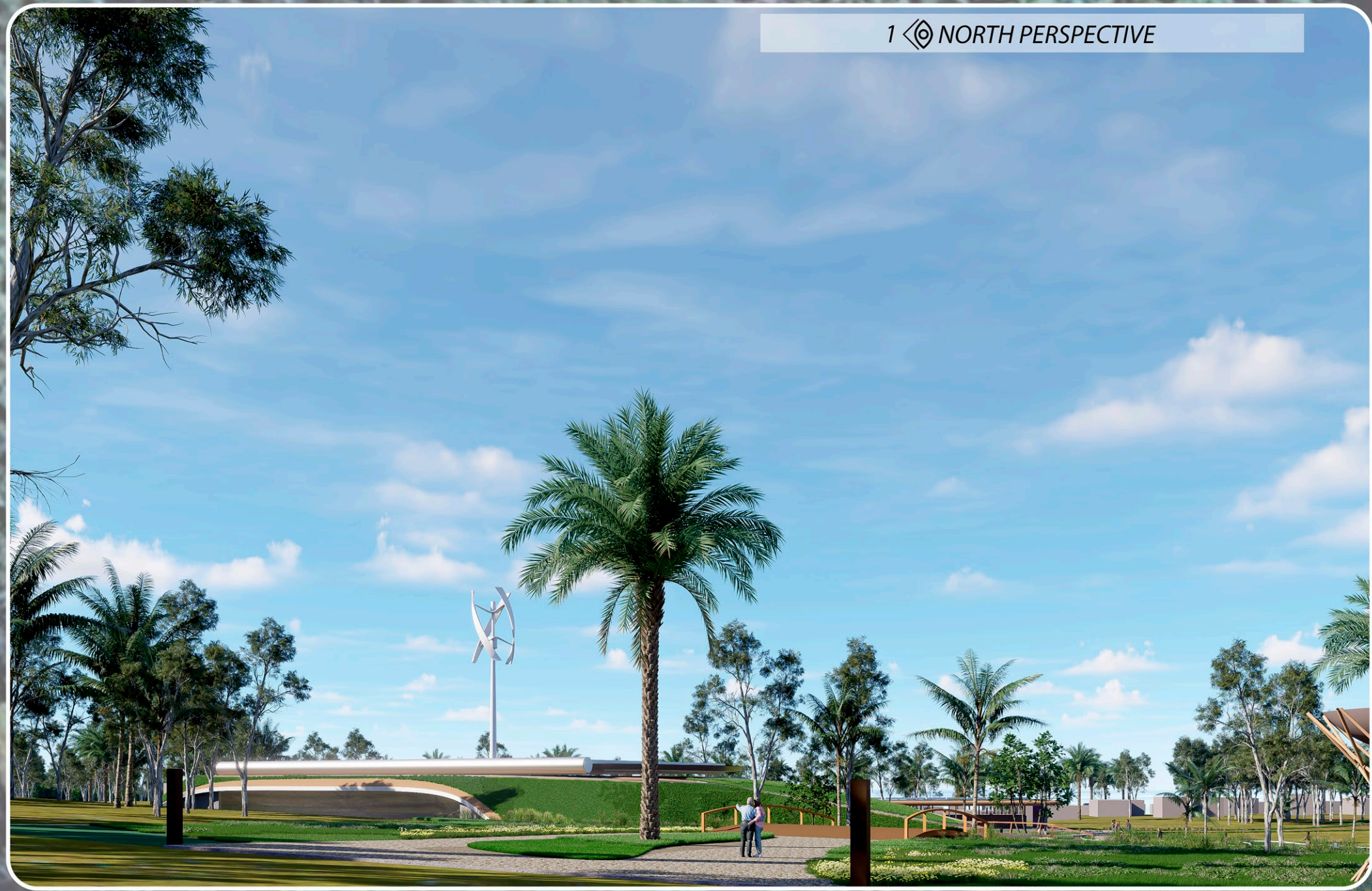
1 NORTH PERSPECTIVE