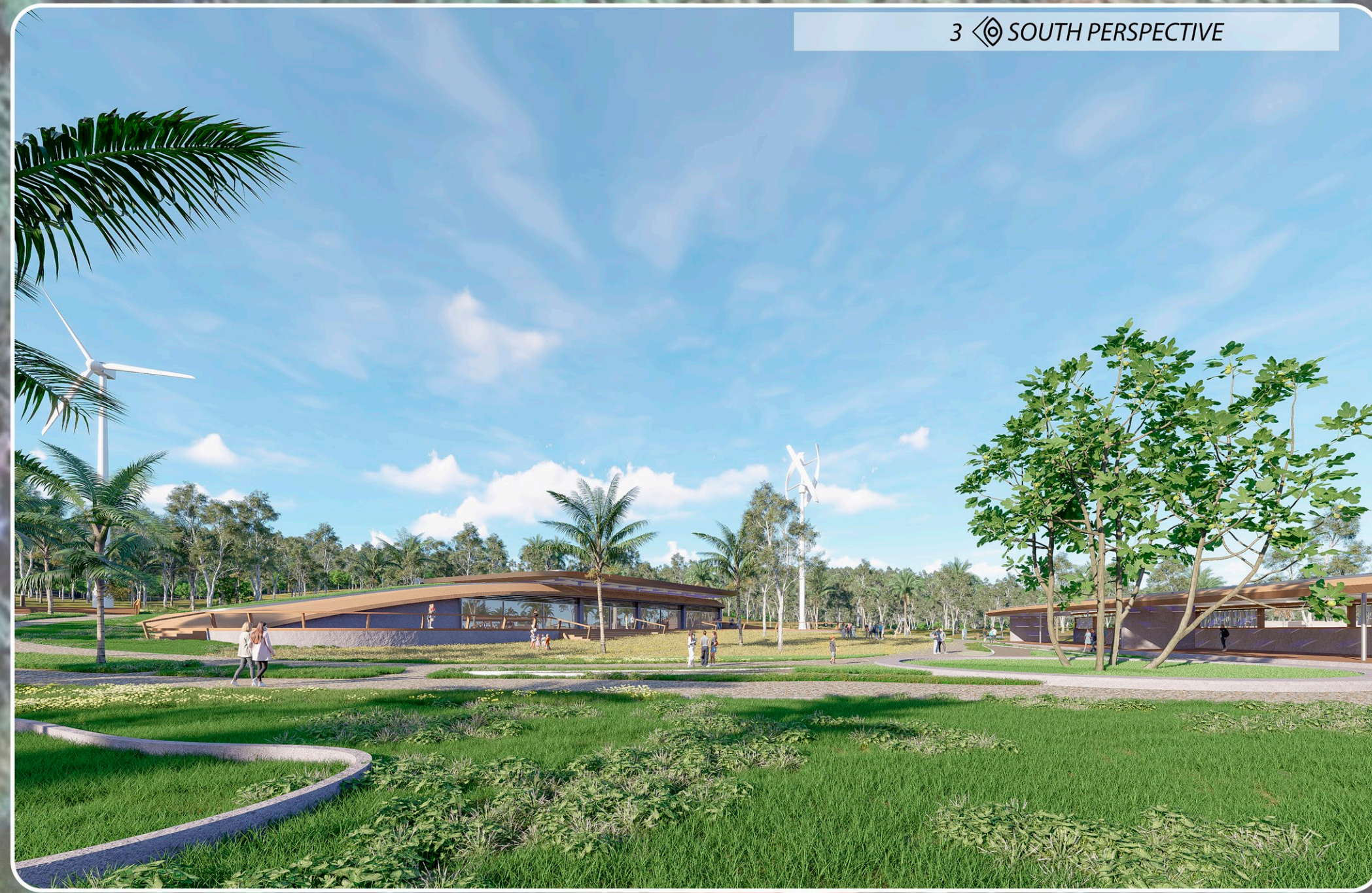
3 SOUTH PERSPECTIVE