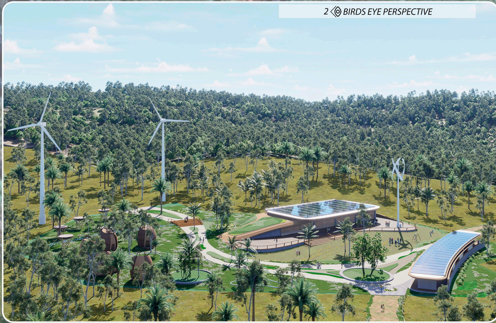
2 BIRDS EYE PERSPECTIVE