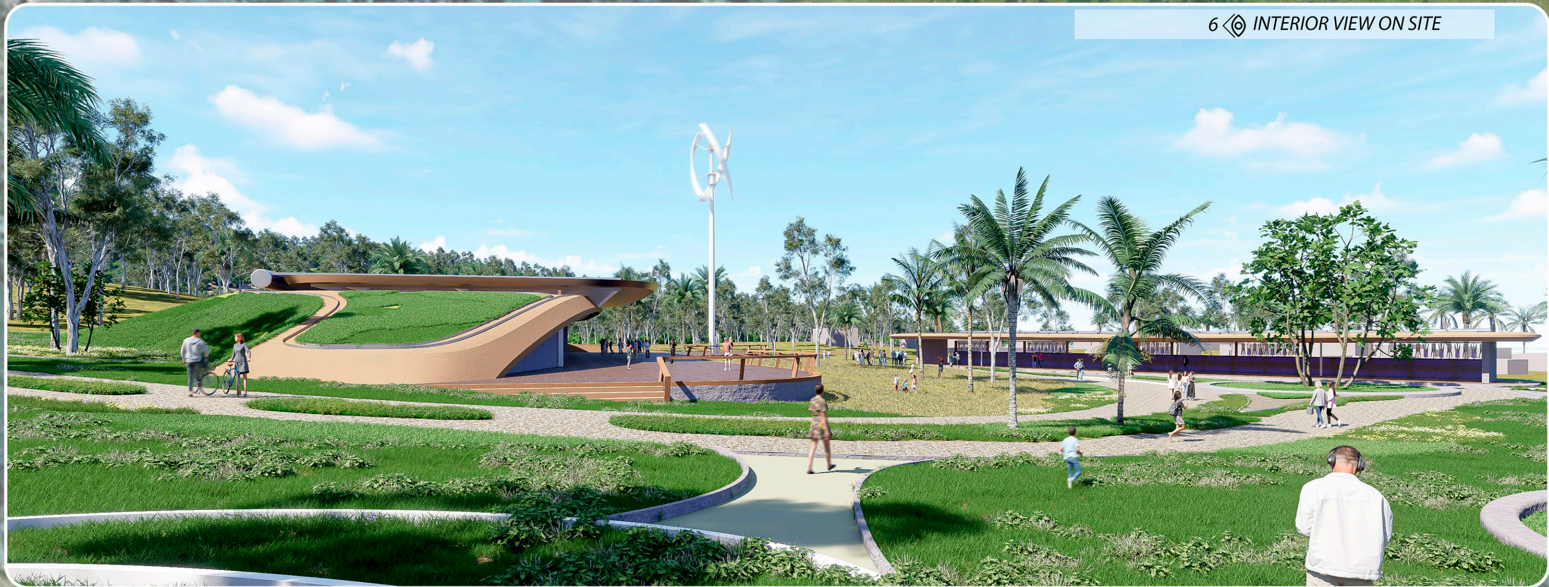
6 INTERIOR VIEW ON SITE