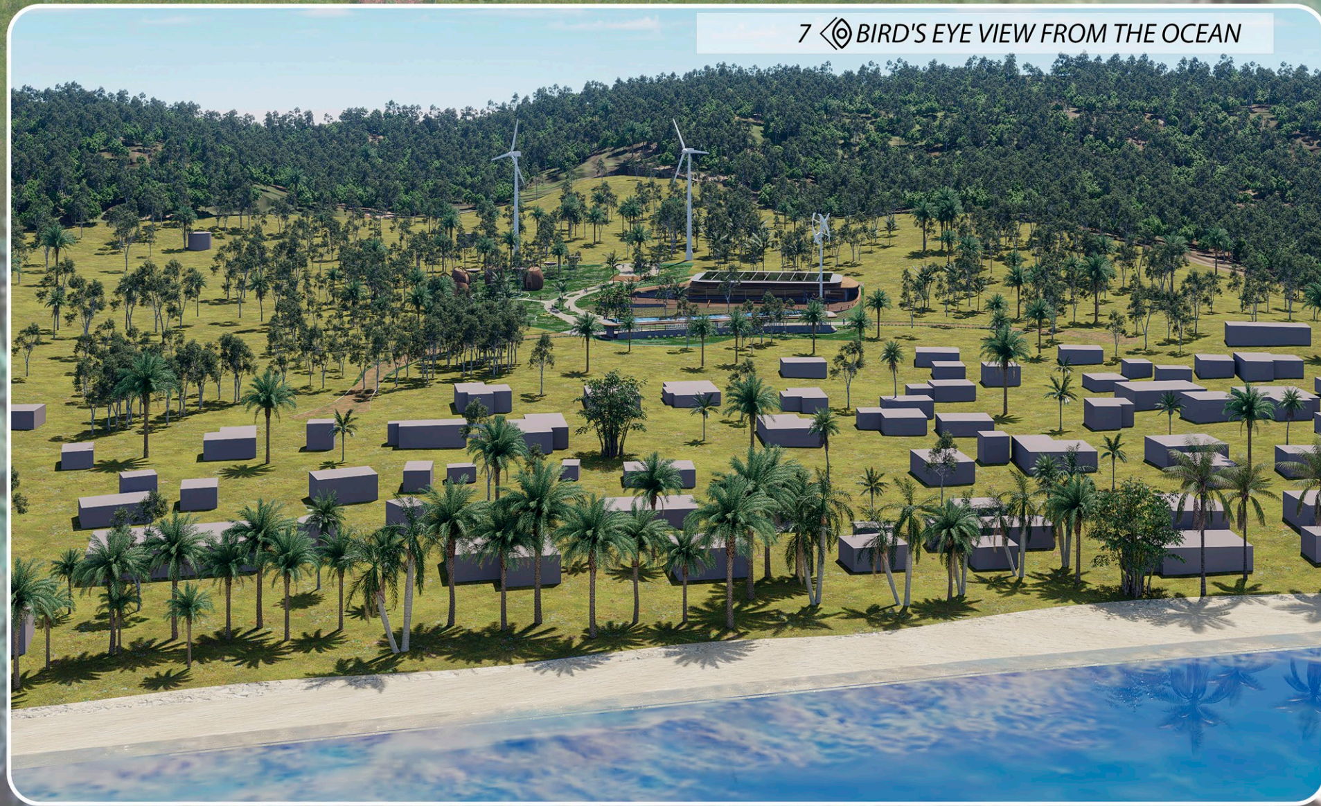
7 BIRD'S EYE VIEW FROM THE OCEAN