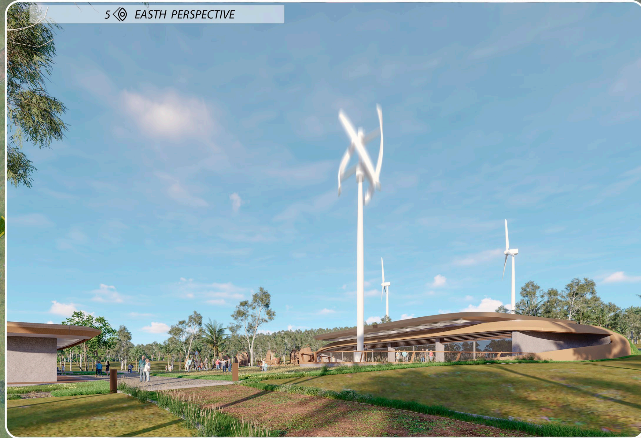
5 EASTH PERSPECTIVE