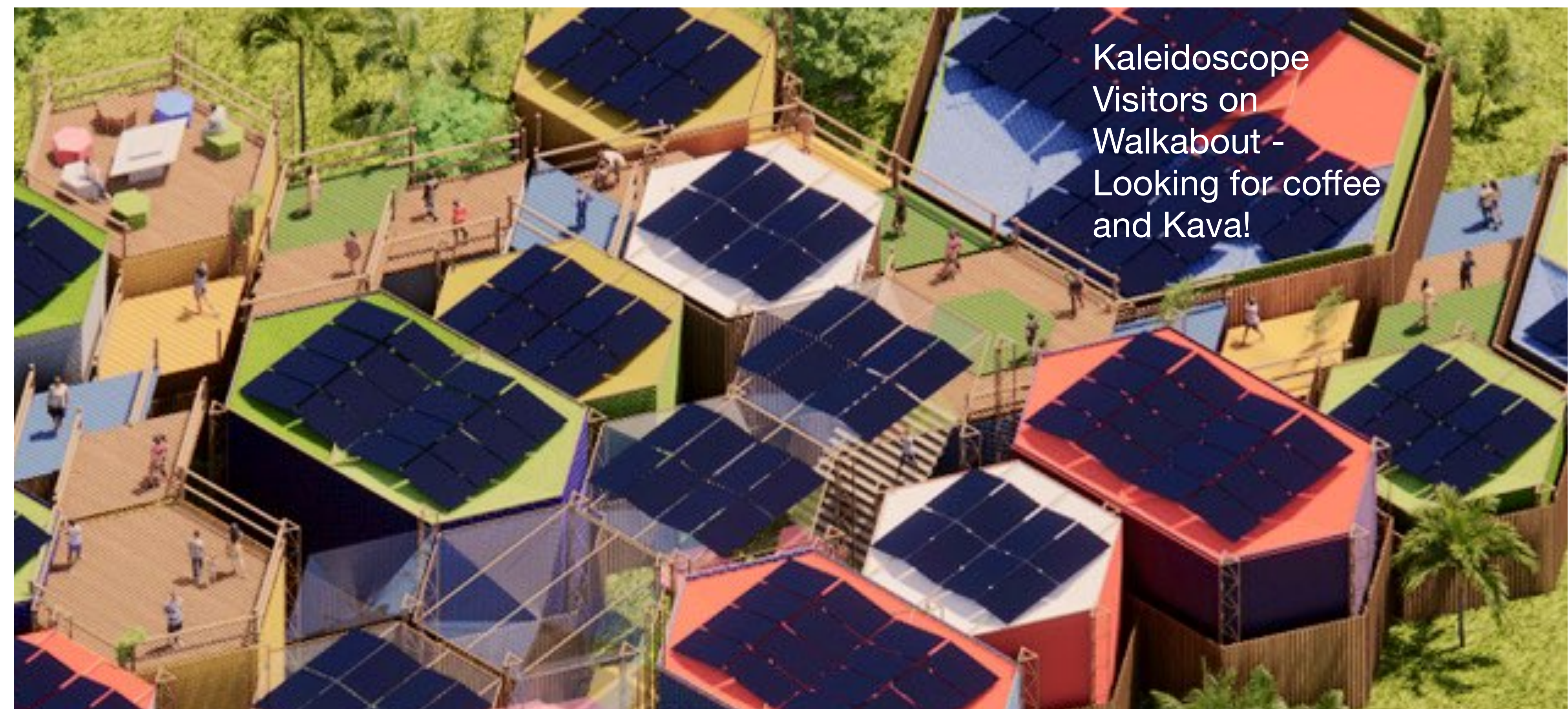
Kaleidoscope Visitors on Walkabout - Looking for coffee and Kava!