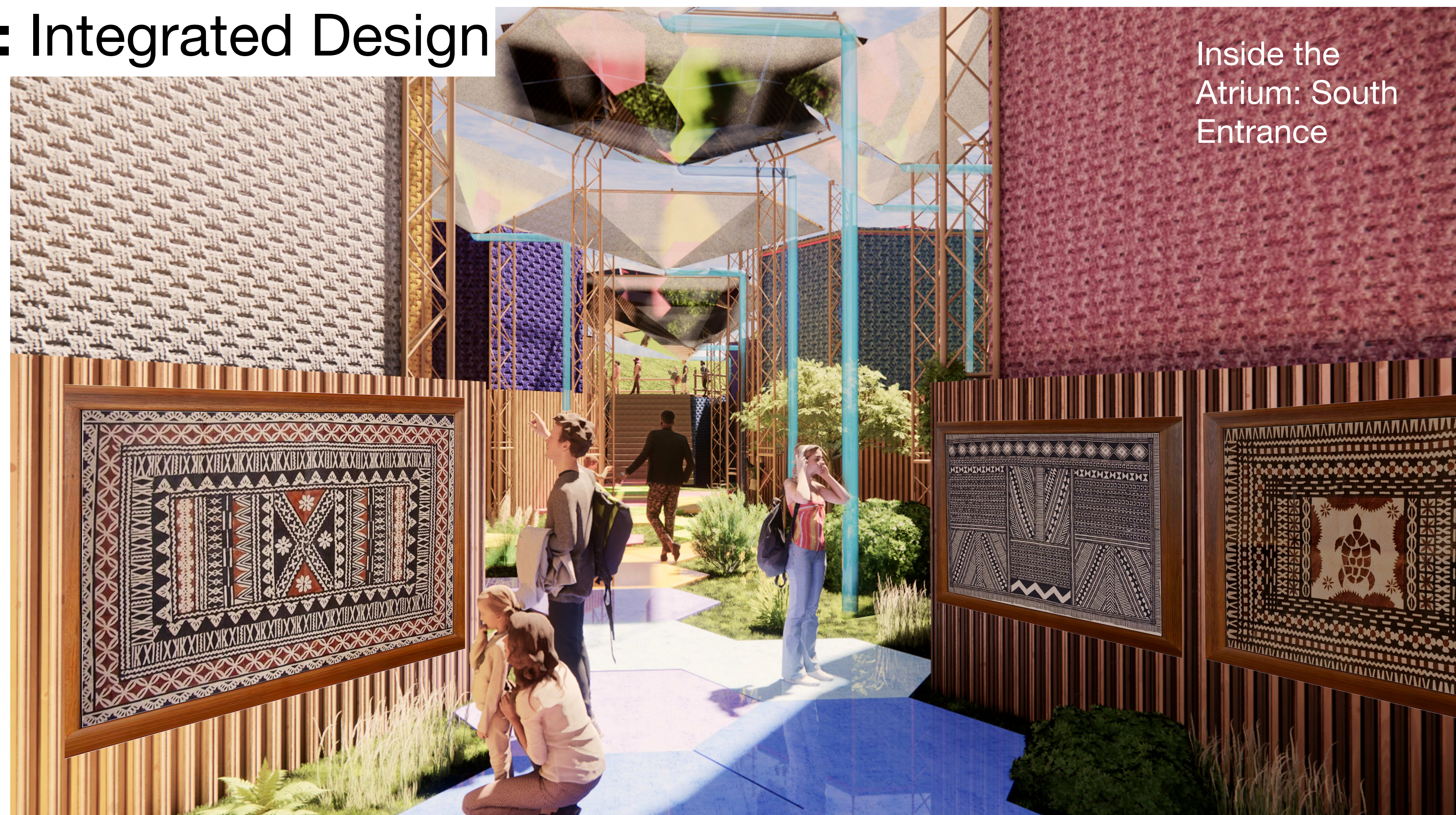
Fijian native art on display in the Atrium. Also note the light blue water hoses coming down.

The Kaleidoscope Module has all required functions integrated on the same footprint : 1: Solar Panels for Energy Harvest 2: Inverted Umbrella for Rain Harvest 3: Vertical Movement for Hurricanes 4: Water Storage 5: Ballast Function-keeping it all down 6: Skirt Storage 7: Impact Protection Barrier 8: Load bearing part of the Kaleidoscope