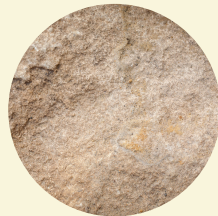
Natural Fibers ex. Stone