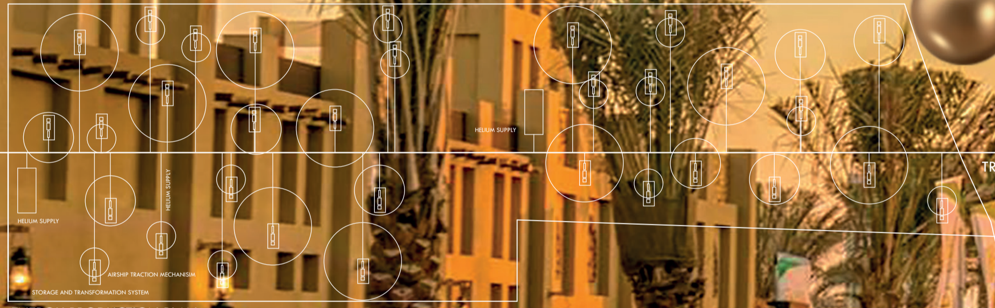
ENERGY PRODUCTION PLAN