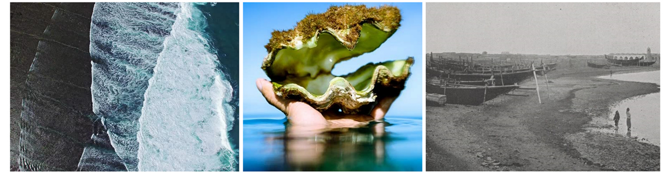
History the pearl diving has woven to UAE history and culture and dated back to 7,000 years. History begins with the Gulf, waves, and Pearls. WAVES, project inspired by history, revive the site by integrating streams of life.