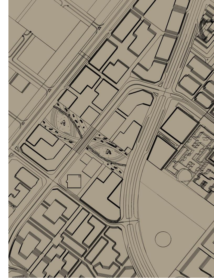
SITE MASTER PLAN