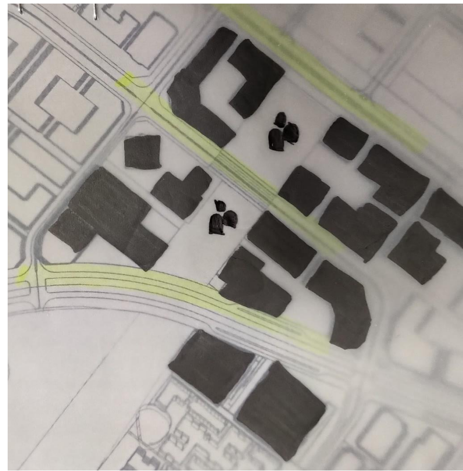
SOLID AND VOID ANALYSIS