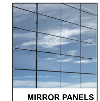
MIRROR PANELS (HELIOSTATS)