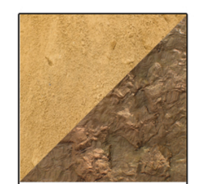
LOCAL SAND AND ROCKS