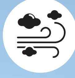
FOG & DEW