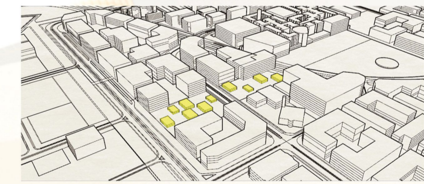
Defining different events

According to the amount and direction of and sunlight of the city, we aimed to generate pure electricity via thin-film photovoltaic panels installed on the windcatcher. In addition, wind turbines help us generate more clean power, so they were located in the entrance of the place, northwest of the site, where winds mostly directed.