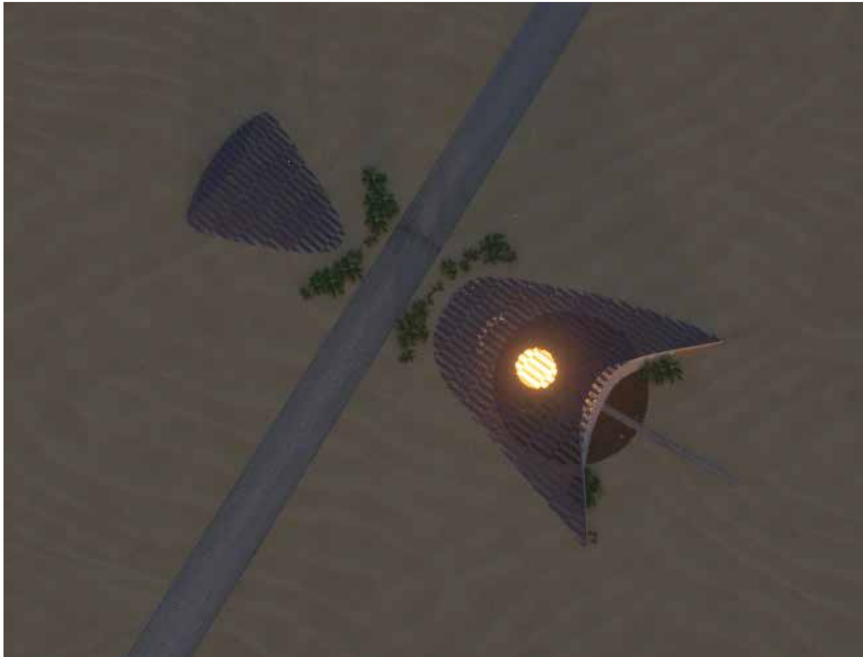
The energy storage facility glows at night when it has extra capacity