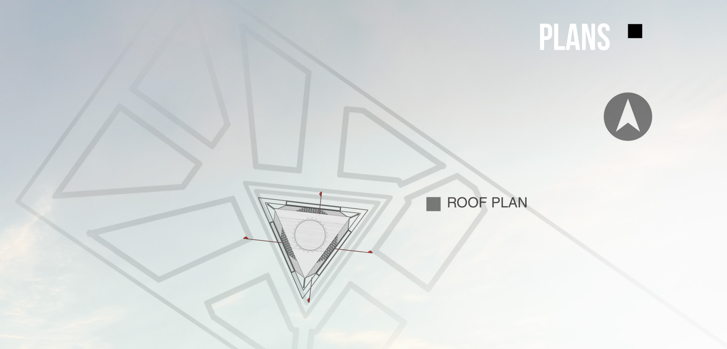
■ ROOF PLAN