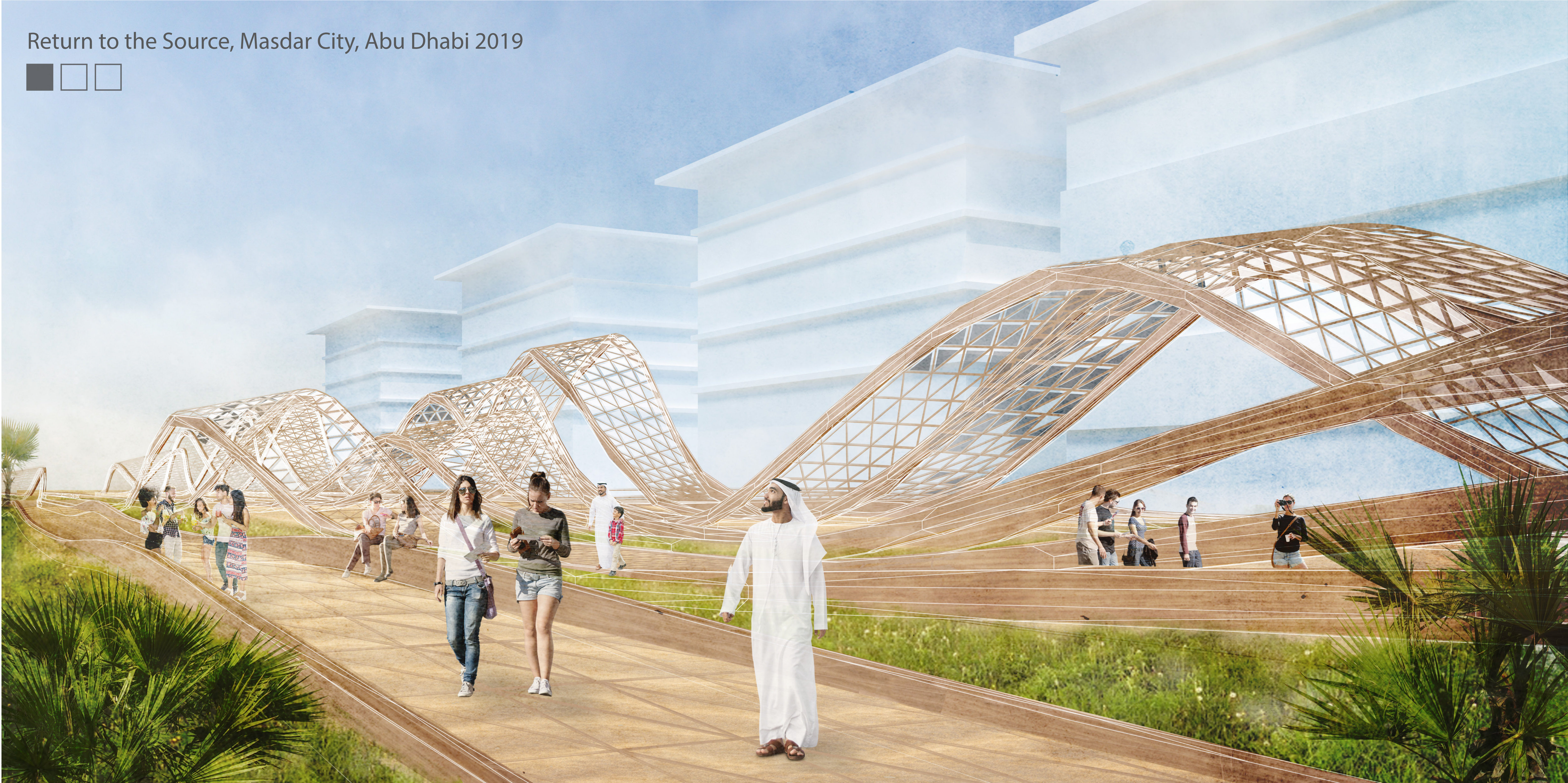
WIND PENETRATING THE SITE