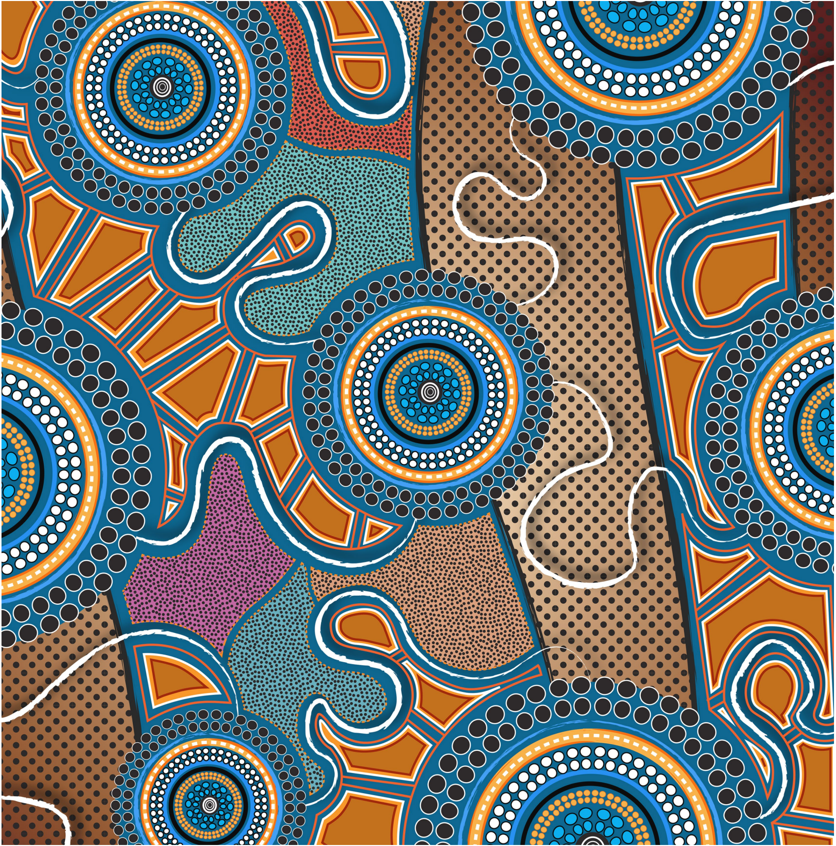
Providing a canvas Artwork by indigenous artists will be integrated into the sculpture and pathway through and evolving cultural program.