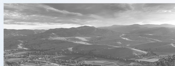
Swifts Creek, Victoria