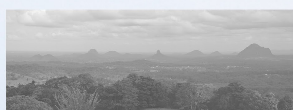
The Glass House Mountains, Queensland