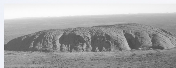
Uluru Ayers Rock, Western