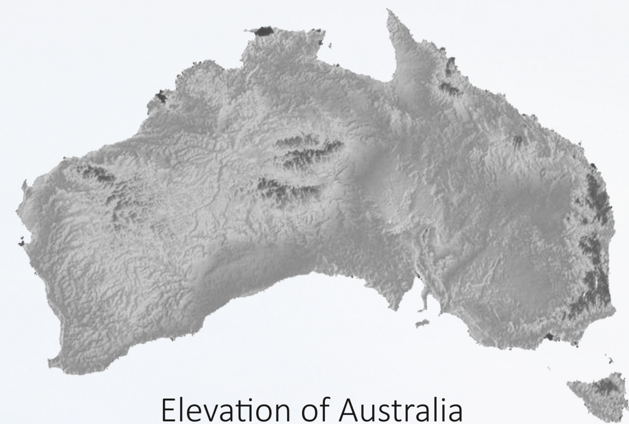
Elevation of Australia