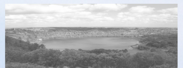
Mount Gambier, South Australia