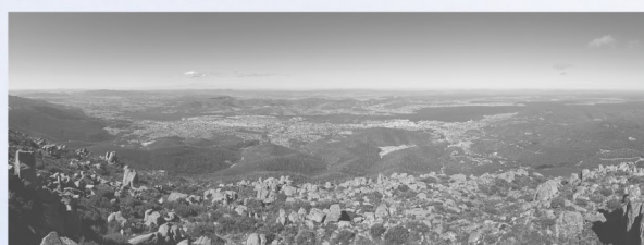
Mount Wellington, Tasmania