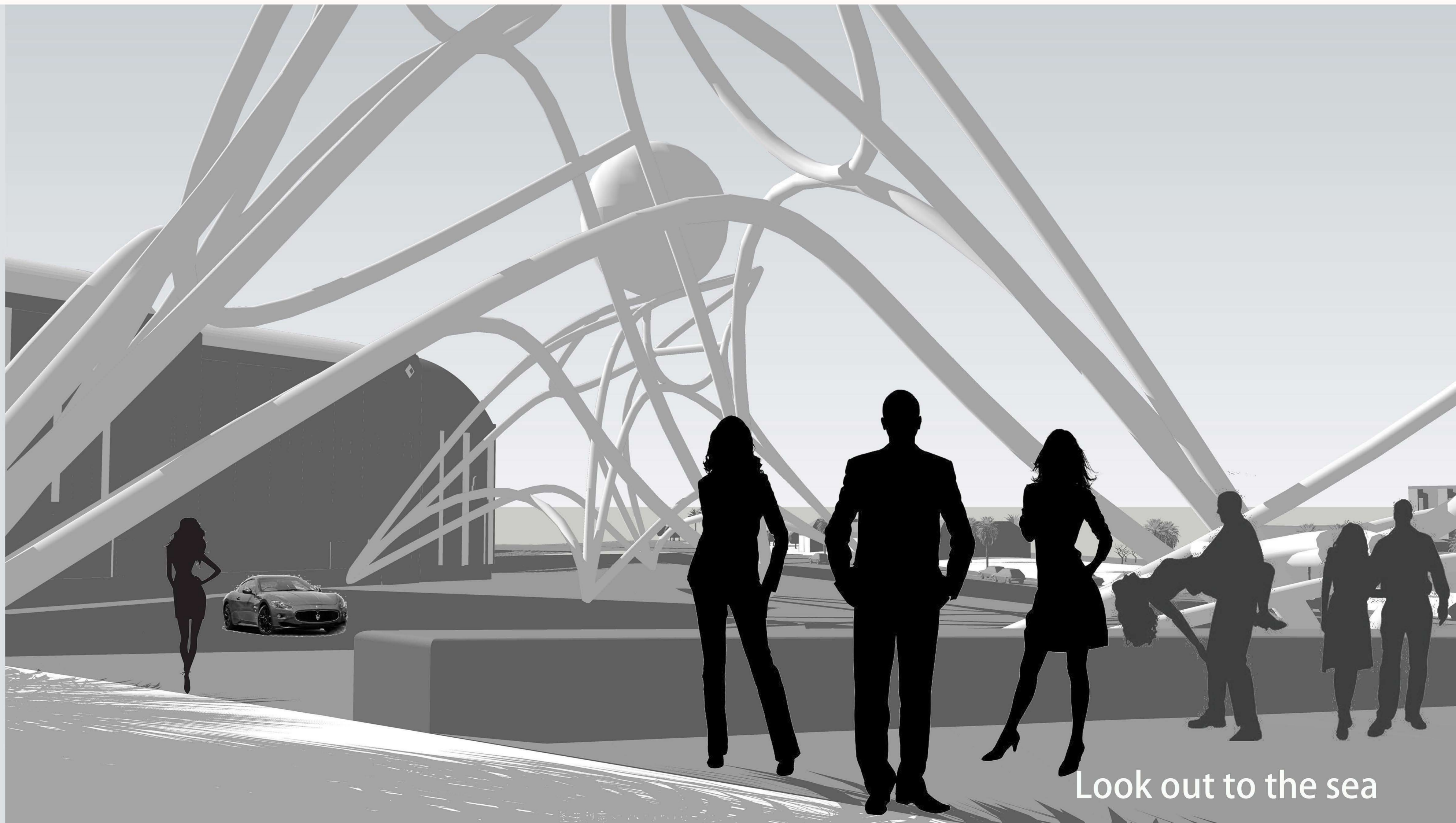
Look out to the sea