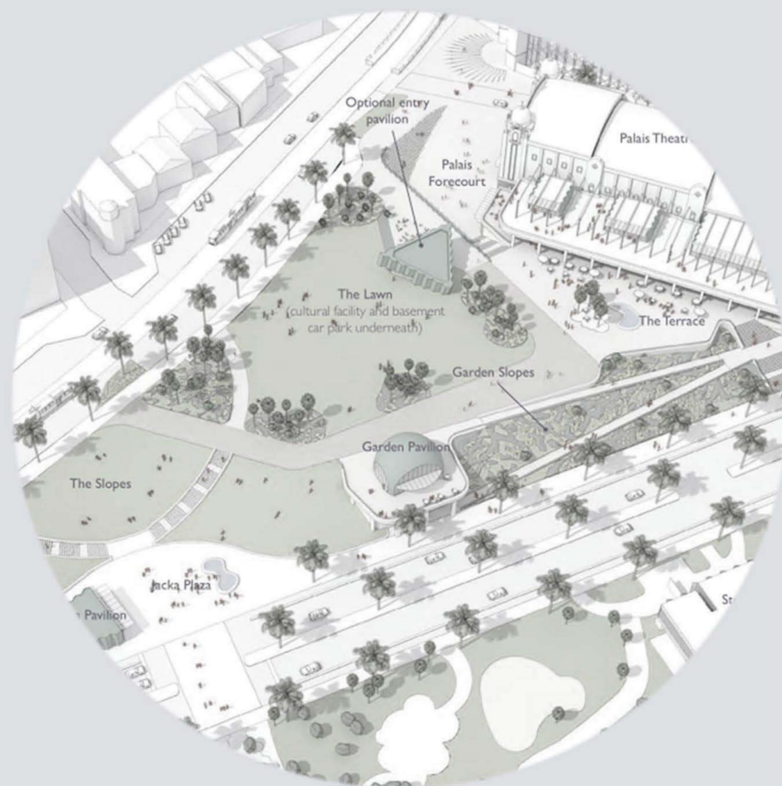
Types of surrounding buildings