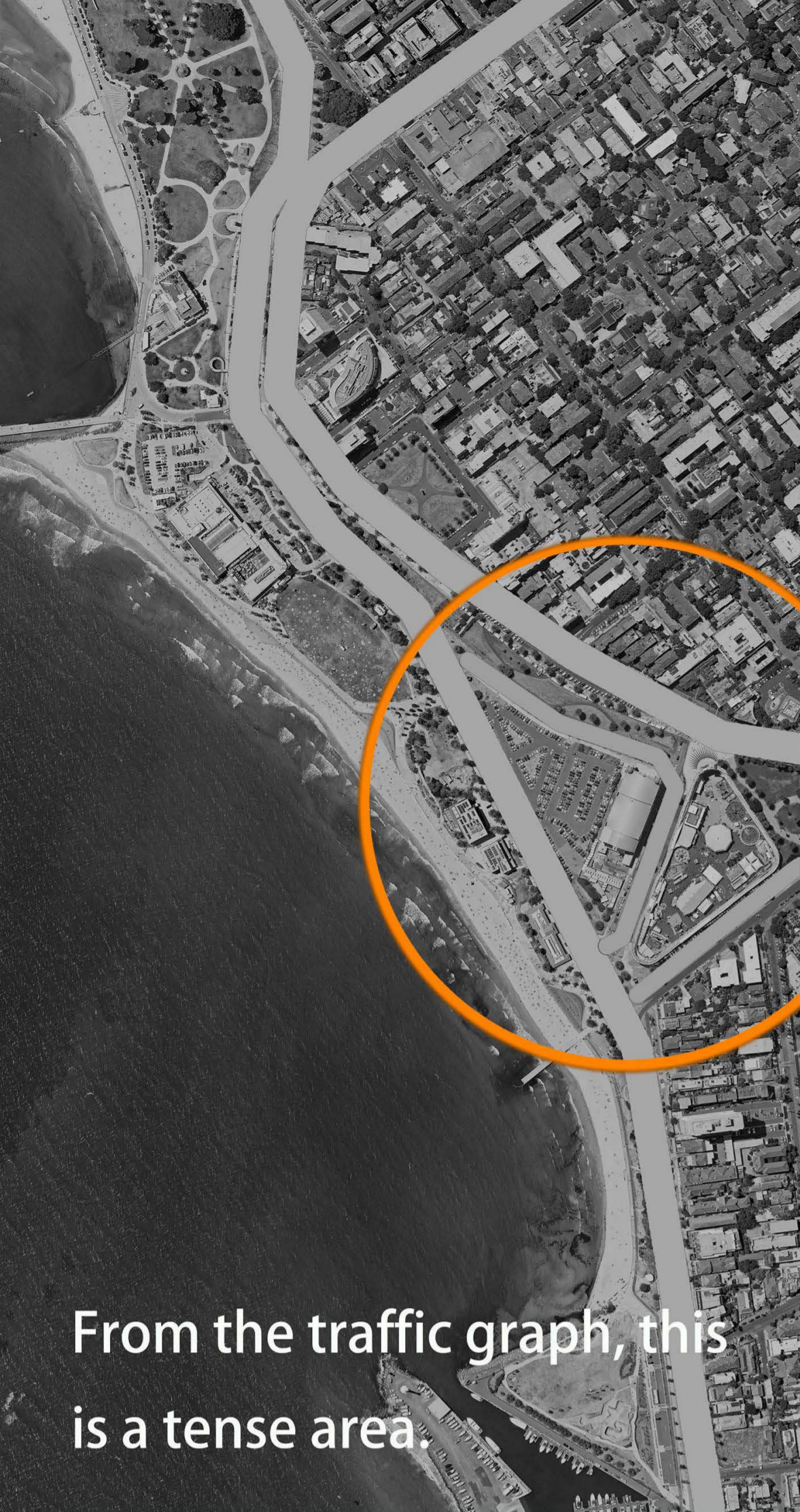
From the traffic graph, this is a tense area.