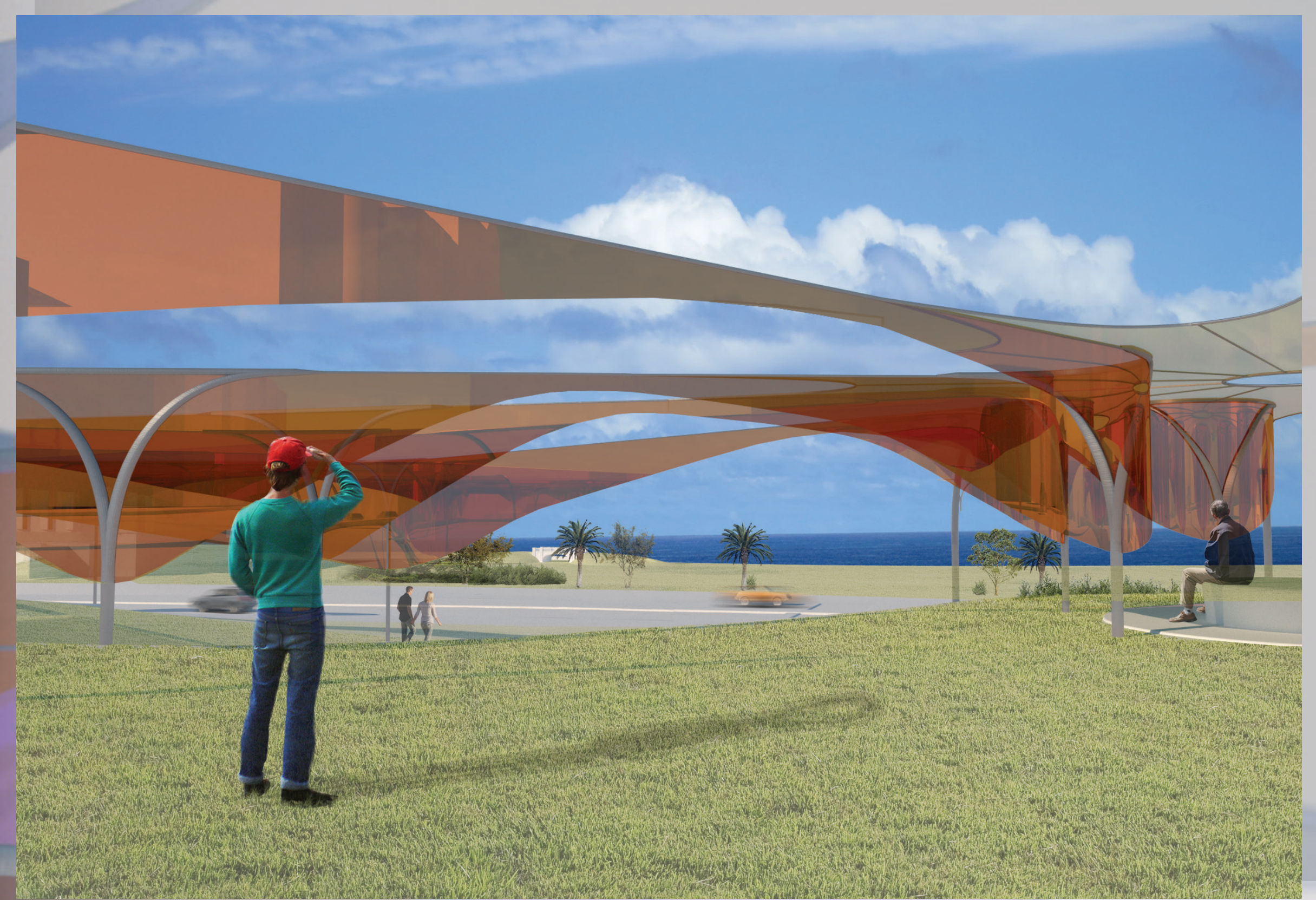
Film on the connecting members lifts up to allow views from the Espalande and across the site.