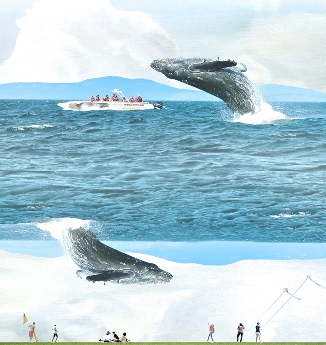
This whale, beckoned by the sunlight and sea breeze, like the real whale in the bay, will even have her own name and birthday and phonation. It will be a lovely and lively new member of Melbourne, and a special scenery of SK kilda.

Therefore, this project aims to visualize this undisclosed, constant but dynamic, spectacular transfusion process . People will re-understand the sea breeze and sunshine and recognize their positive energy. Imagine a whale living in a piece of sea, using sunlight and wind as food. Normally, the whale is hidden under the surface of water. When the sea breeze and sunlight pass by, it leave a tangle of ripple. People simultaneously feel like to look up to the sky from under the water surface, observing the changes, the light and shadow created by the ripples. When the sun and wind accumulate enough energy for them, the whales will emerge from the sea like the animals that were fed in the marine pavilion. In this process you will see how the sun and the wind change the form of the water surface into the exciting moment of bringing up a living creature.